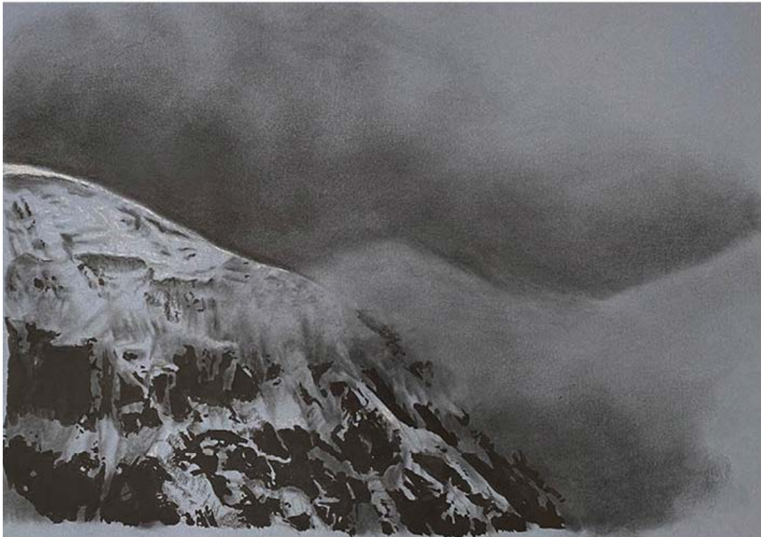
(21) Antarctic Ascent , 2023 charcoal on paper, 7½ x 11 ins, 19 × 28 cm