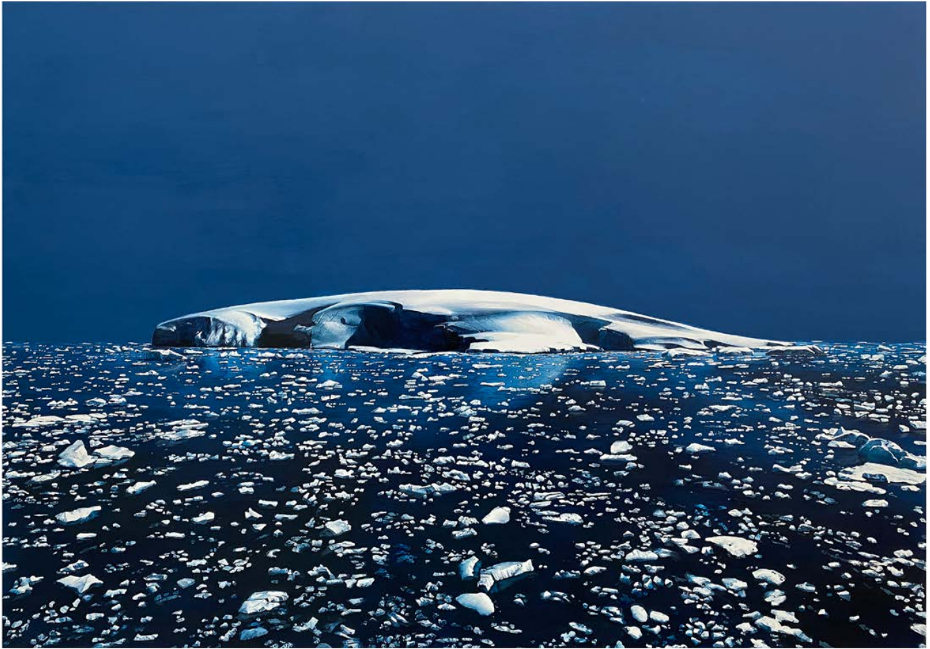
(7) Encounters, Antarctica , 2023 oil and acrylic on panel, 27½ x 39¼ ins, 70 × 100 cm