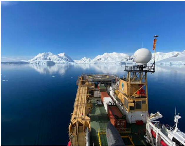
From the Crow's nest, HMS Protector