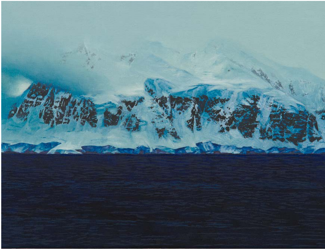
(22) Antarctic Range , 2023 oil and acrylic on canvas, 11 3 / 4 x 15 3 / 4 ins, 30 × 40 cm