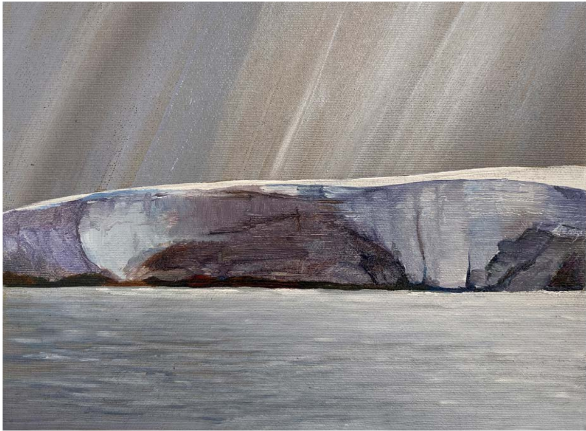
(19) Gossamer, Antarctica, 2023 oil and linen on board, 7 × 9¾ ins, 18 × 25 cm