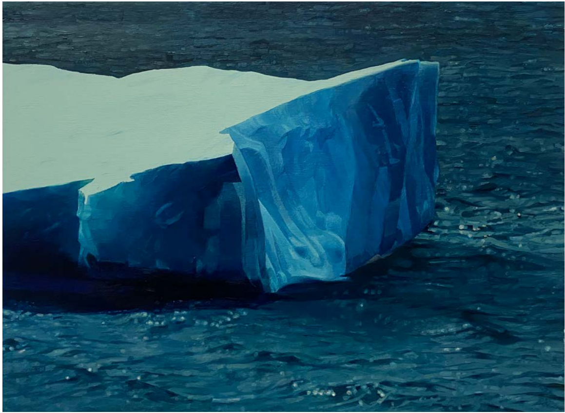
(24) Antarctic Shift , 2023 oil and acrylic on panel, 11¾ x 15¾ ins, 30 × 40 cm