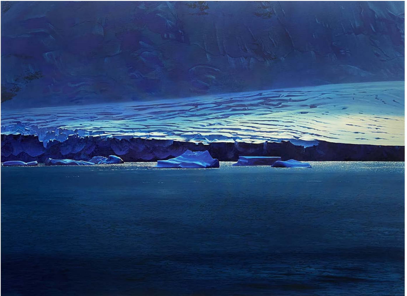
(3) Meditation on a Glacier , 2024 oil and acrylic on panel, 35¾ x 48 ins, 91 x 122 cm