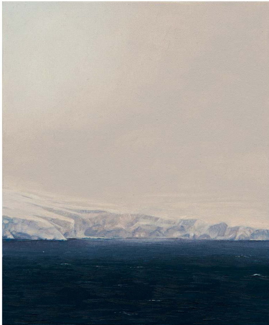
(14) Lost Horizons , 2023 oil and acrylic on canvas, 11¾ x 9¾ ins, 30 × 25 cm