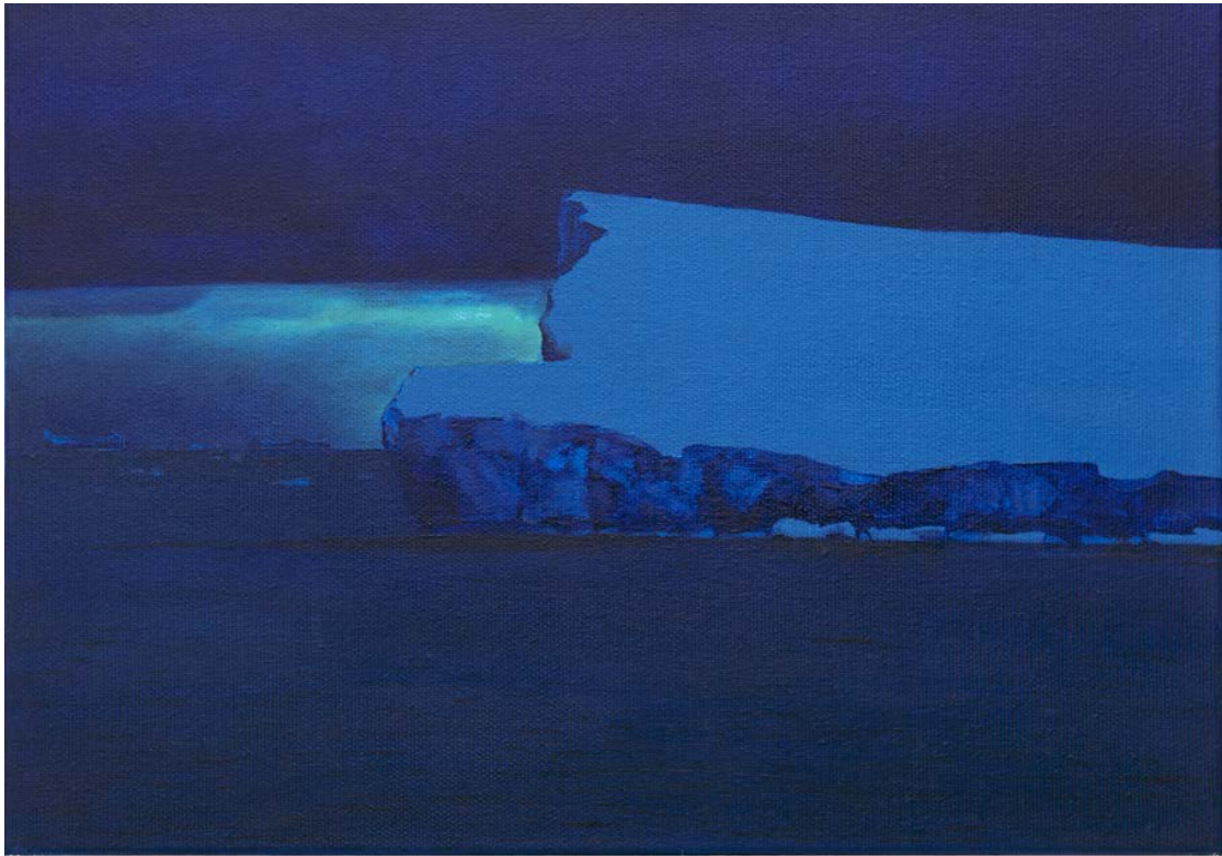
(4) Slab, Antarctica , 2023 oil and acrylic on canvas, 9¾ x 14¼ ins, 25 × 36 cm