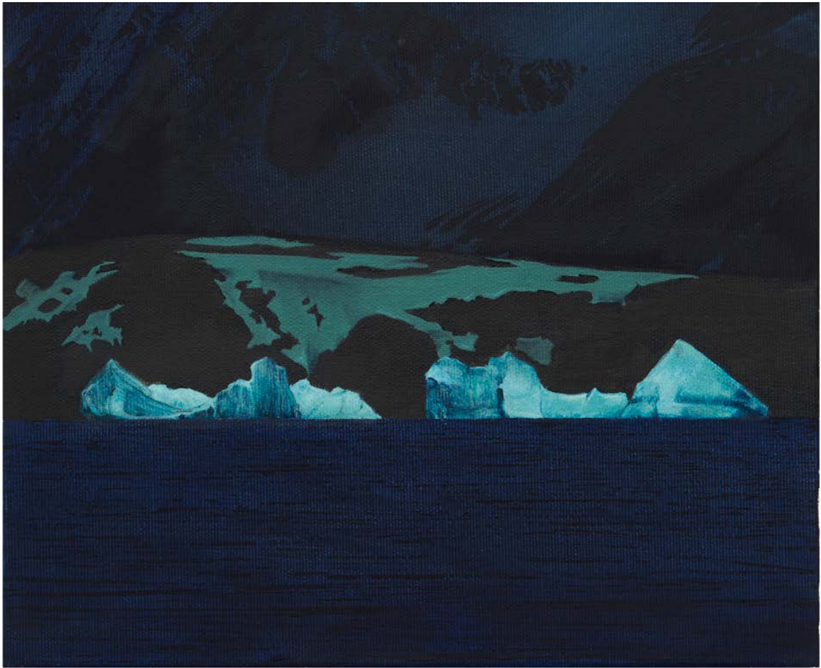
(10) What Time is Day , 2024 oil and acrylic on canvas, 9¾ x 11¾ ins, 25 x 30 cm