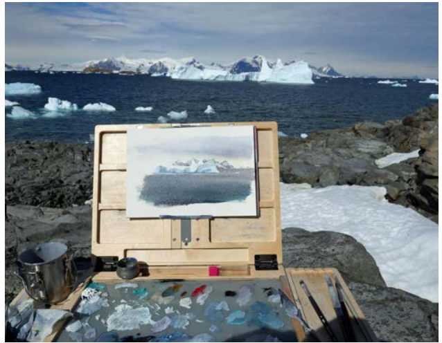
The artist's heated easel