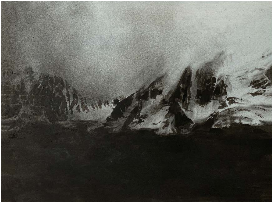
(18) Delirium Antarctica , 2023 charcoal on paper, 6 × 7¼ ins, 15 × 20 cm