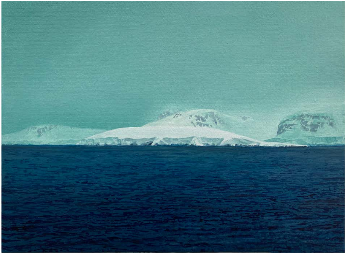
(23) Antarctic Dreams , 2023 oil and acrylic on canvas, 11 3 / 4 x 15 3 / 4 ins, 30 × 40 cm