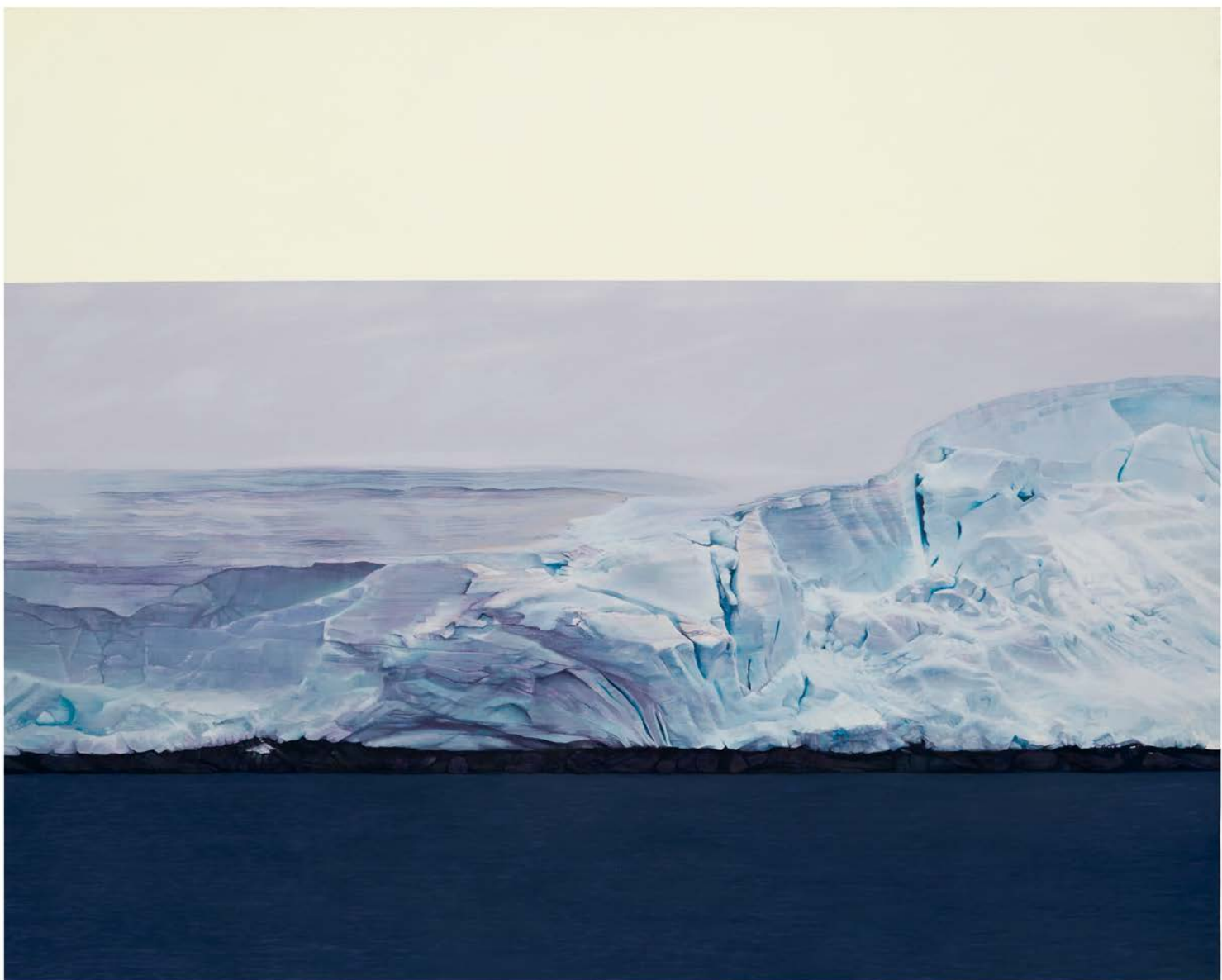
(2) Ice Slice , 2024 oil and acrylic on canvas, 48 × 59¾ ins, 122 × 152 cm