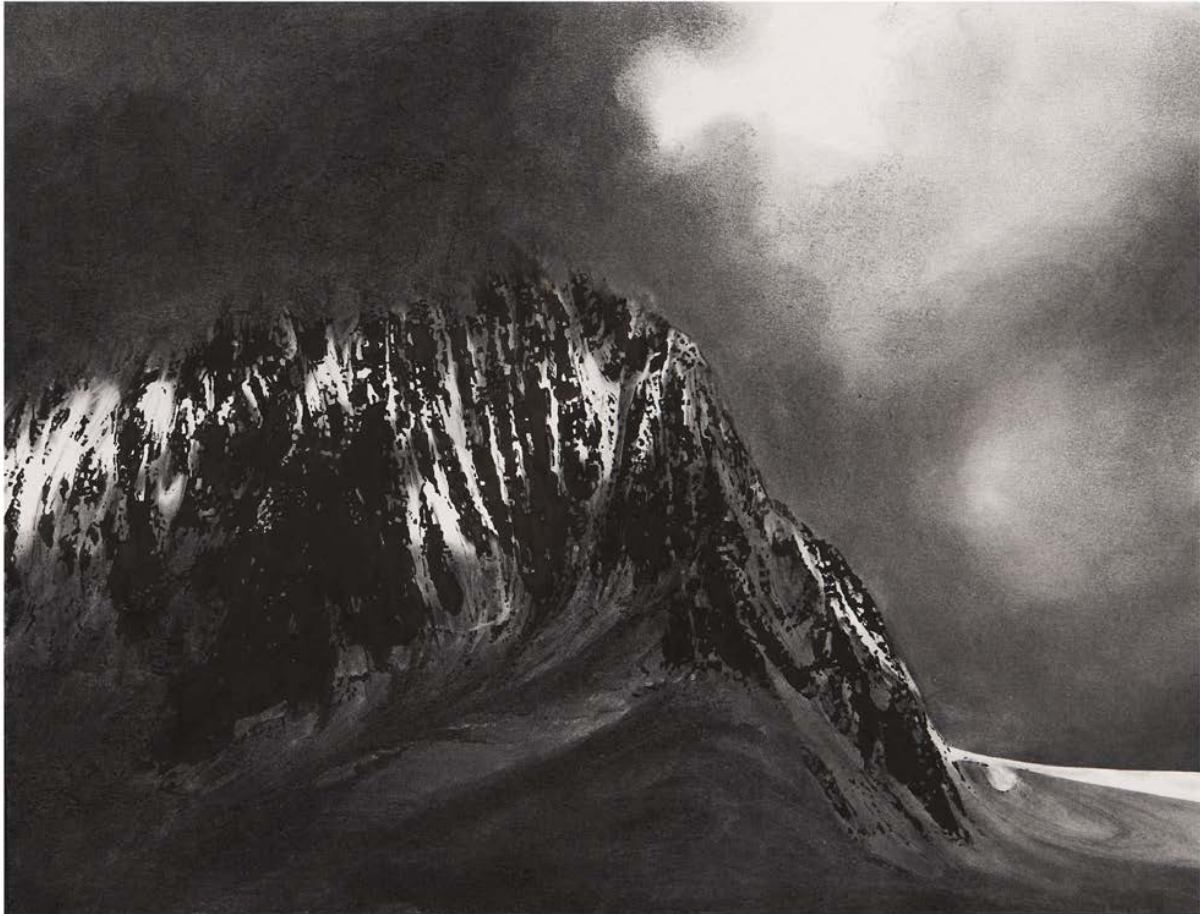
(27) The Edge , 2024 ink and charcoal on paper, 18 × 24 ins, 46 × 61 cm