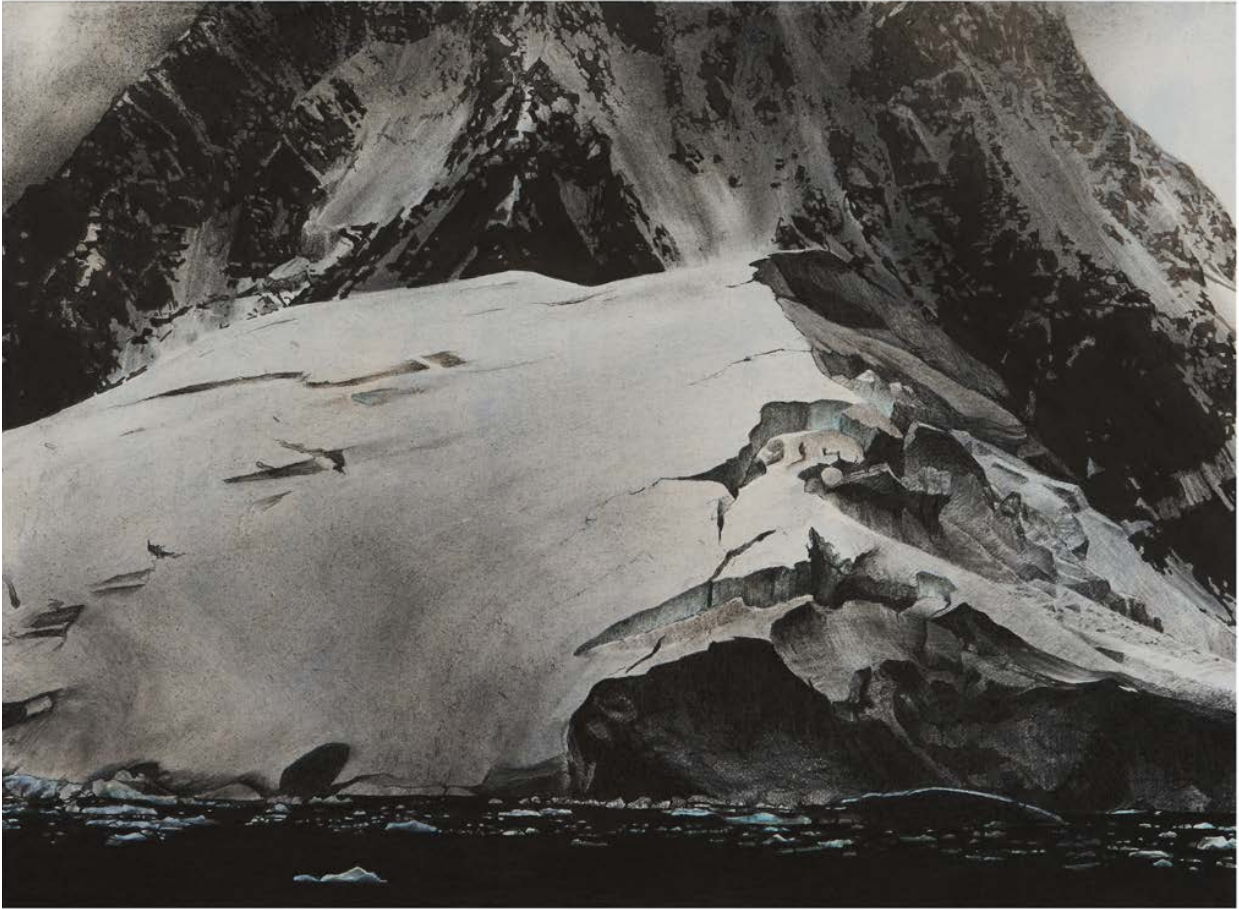
(8) Ice, Antarctica, 2023 ink, watercolour and charcoal on paper, 21¼ x 29¼ ins, 54 × 74 cm