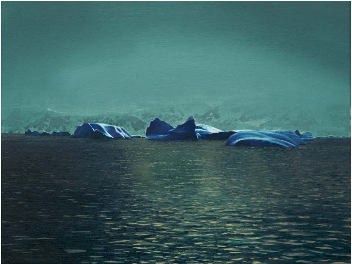
(30) Ice Blink , 2023 oil and acrylic on canvas, 11 3 / 4 x 15 3 / 4 ins, 30 × 40 cm