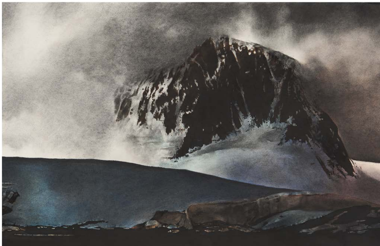
(13) Massif , 2024 charcoal and watercolour on paper, 17¼ x 27¼ ins, 44 × 69 cm