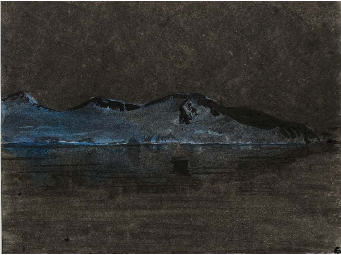
(11) Sliver, Antarctica , 2023 charcoal, ink and watercolour on paper, 6 × 7¾ ins, 15 × 20 cm