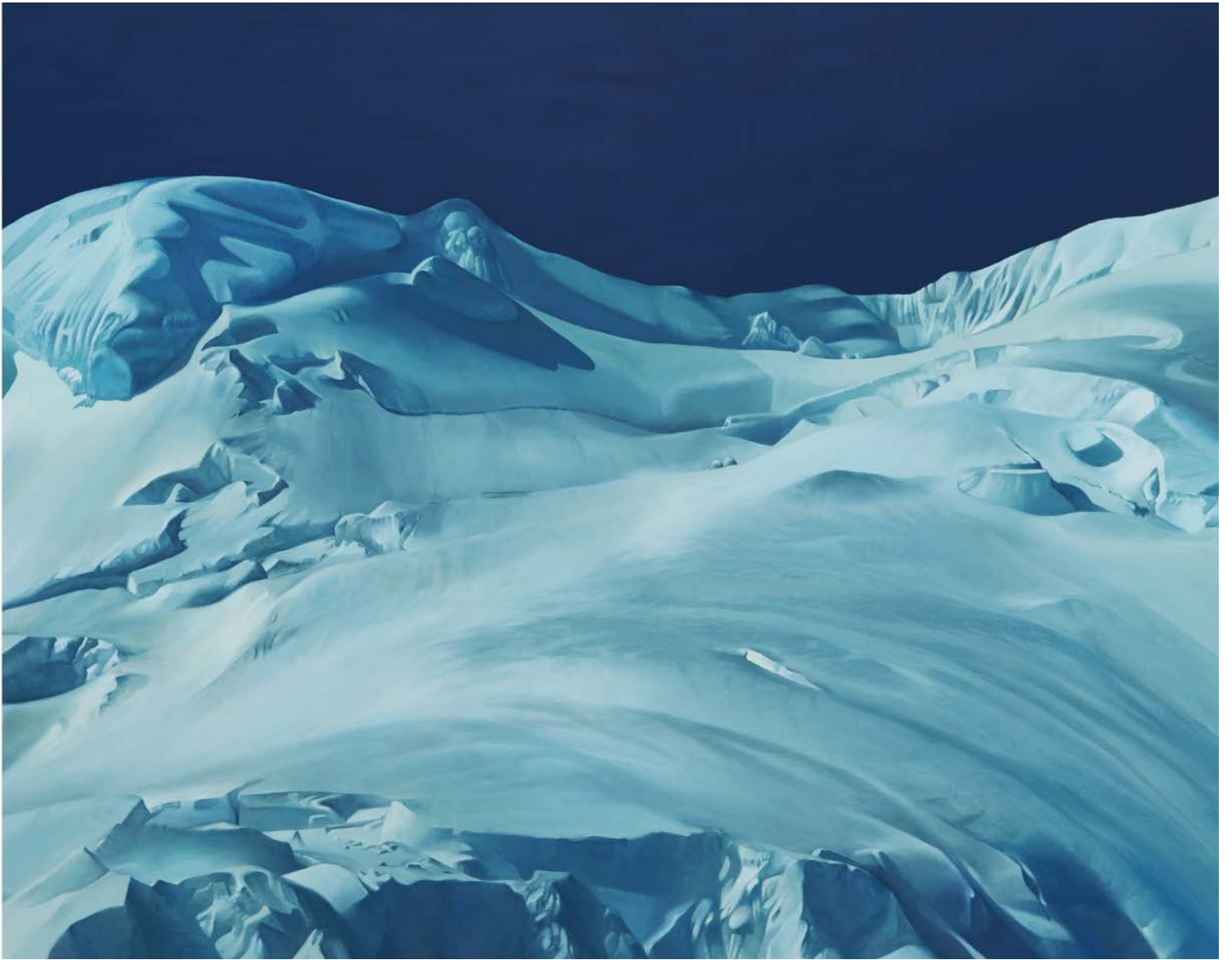
(9) Mass, Antarctica , 2024 oil and acrylic on canvas, 48 × 59¾ ins, 122 × 152 cm