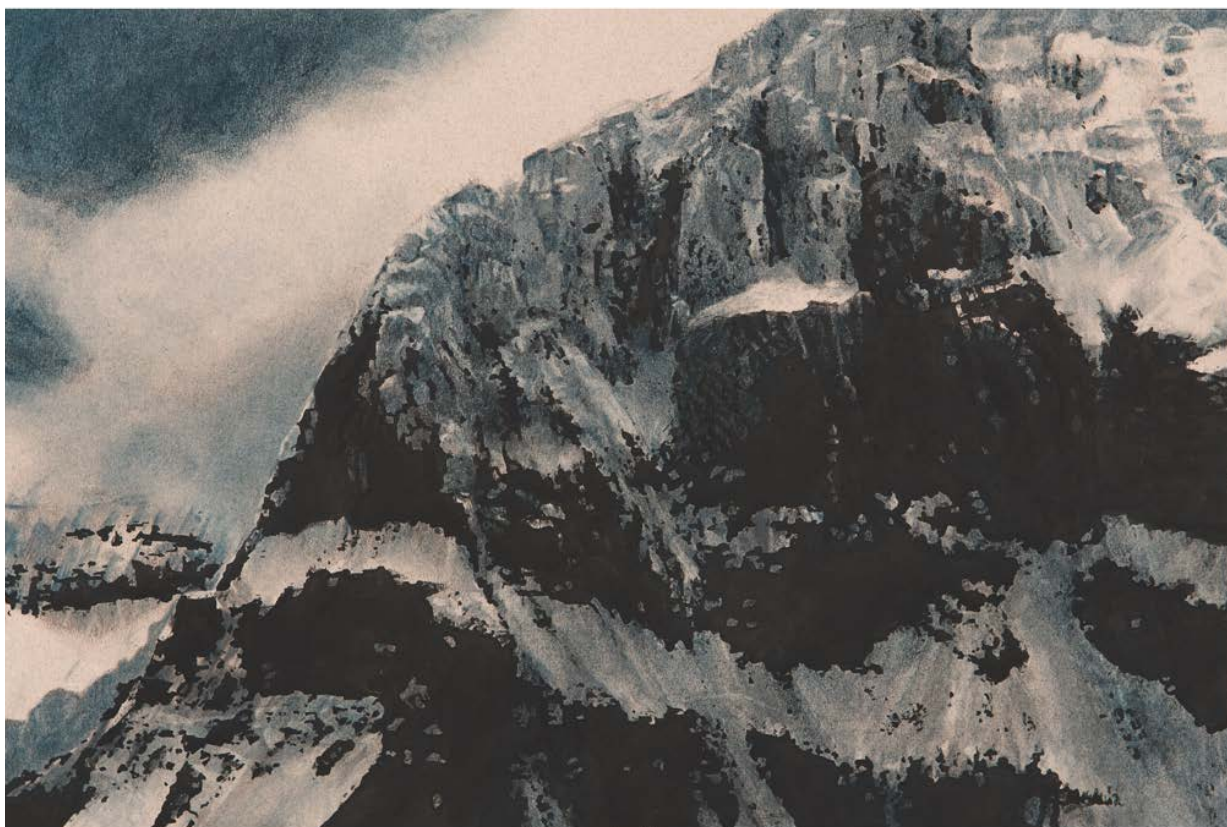
(20) Crag , 2024 pastel, ink and charcoal on paper, 15¼ x 23¼ ins, 39 × 59 cm