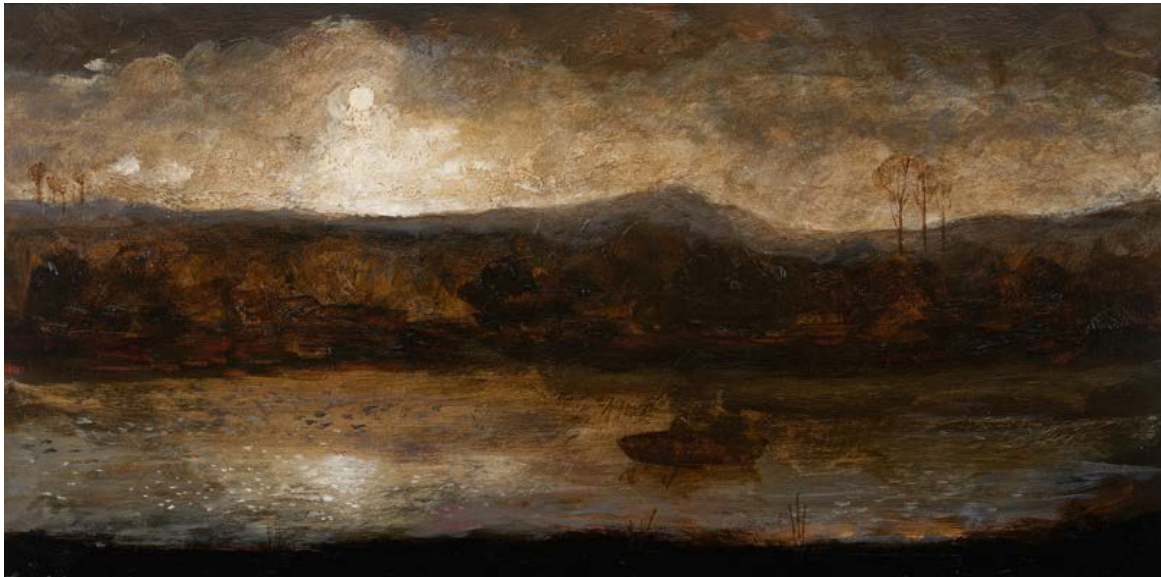
Now Dark, Now Glittering, Now Reflecting Gloom II, 2021 (cat. 38) acrylic on gesso board 10 x 20 ins, 25.5 x 51 cms