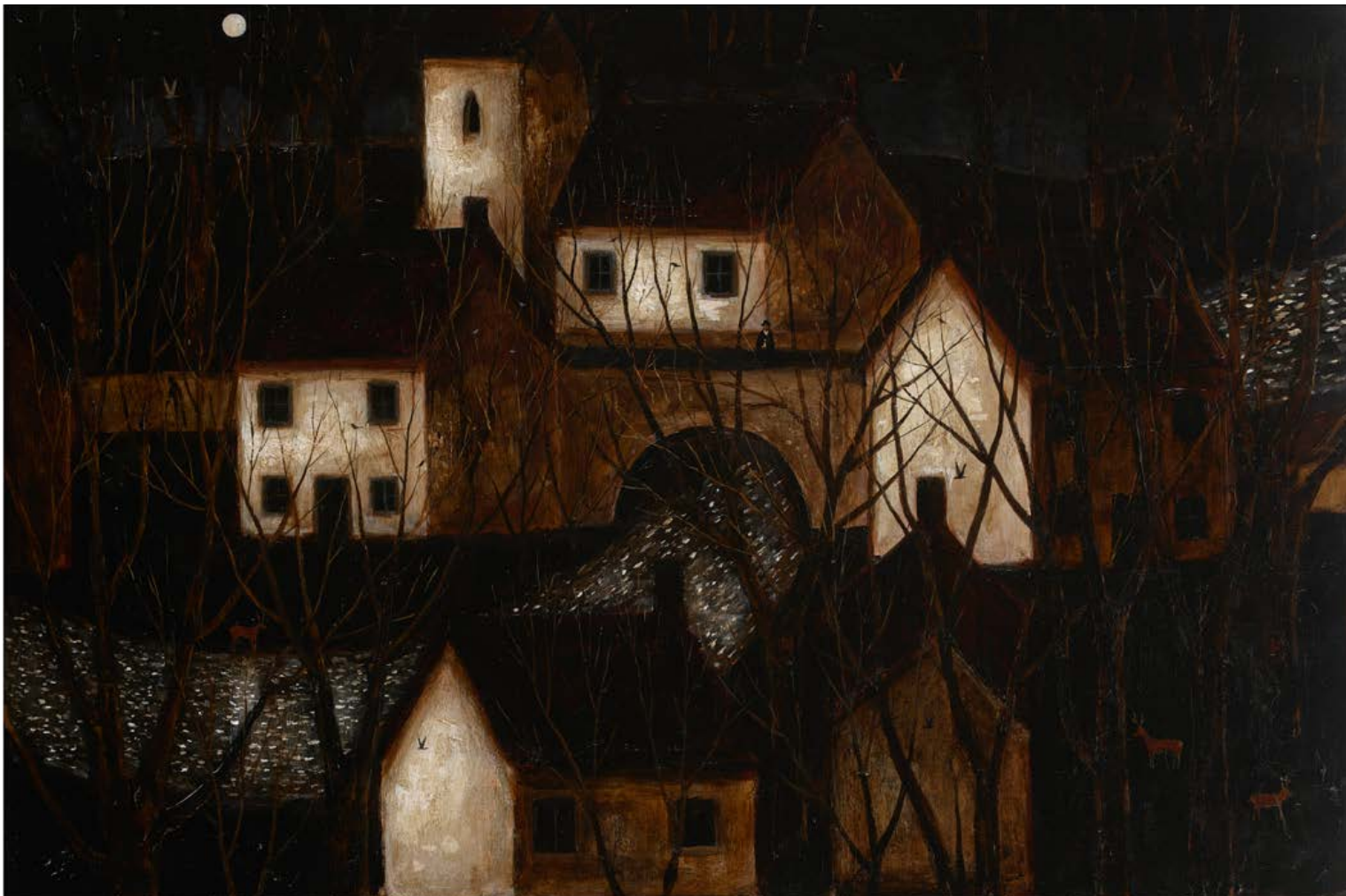
A River Wish, 2021 (cat. 8) acrylic on canvas 24 x 36 ins, 61 x 91.5 cms