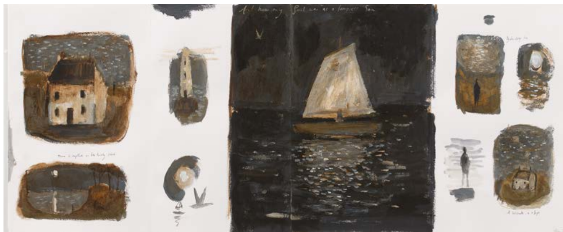
Sketch Book Pages, 2021 acrylic on paper 11½ x 16 ins, 29 x 41 cms