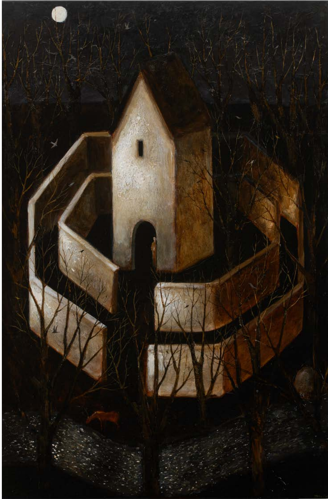
A Solitude, A Refuge, I, 2021 (cat. 12) acrylic on gesso board 36 x 24 ins, 91.5 x 61 cms