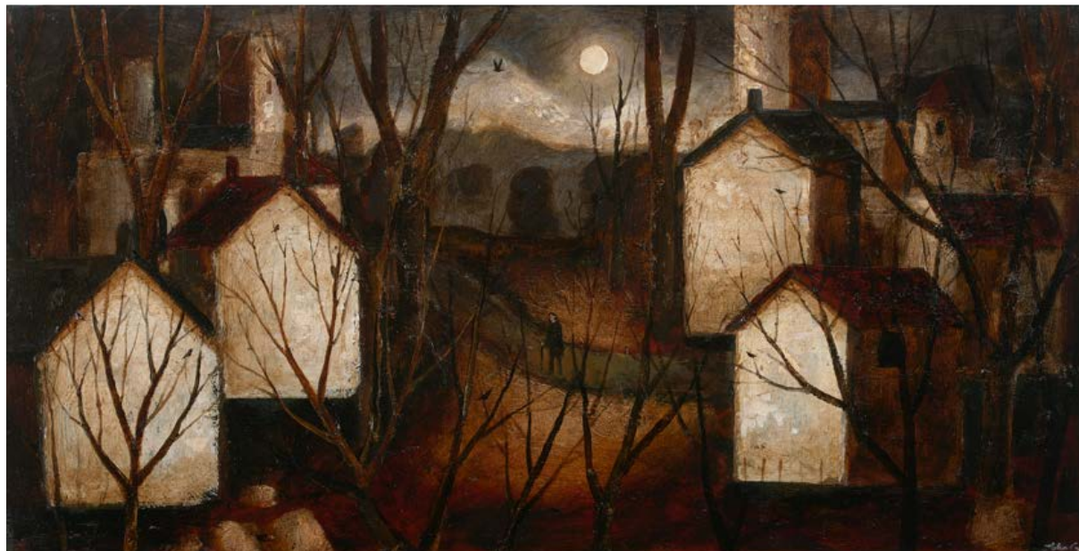
To the Woods, 2021 (cat. 25) acrylic on gesso board 10 x 20 ins, 25.5 x 51 cms