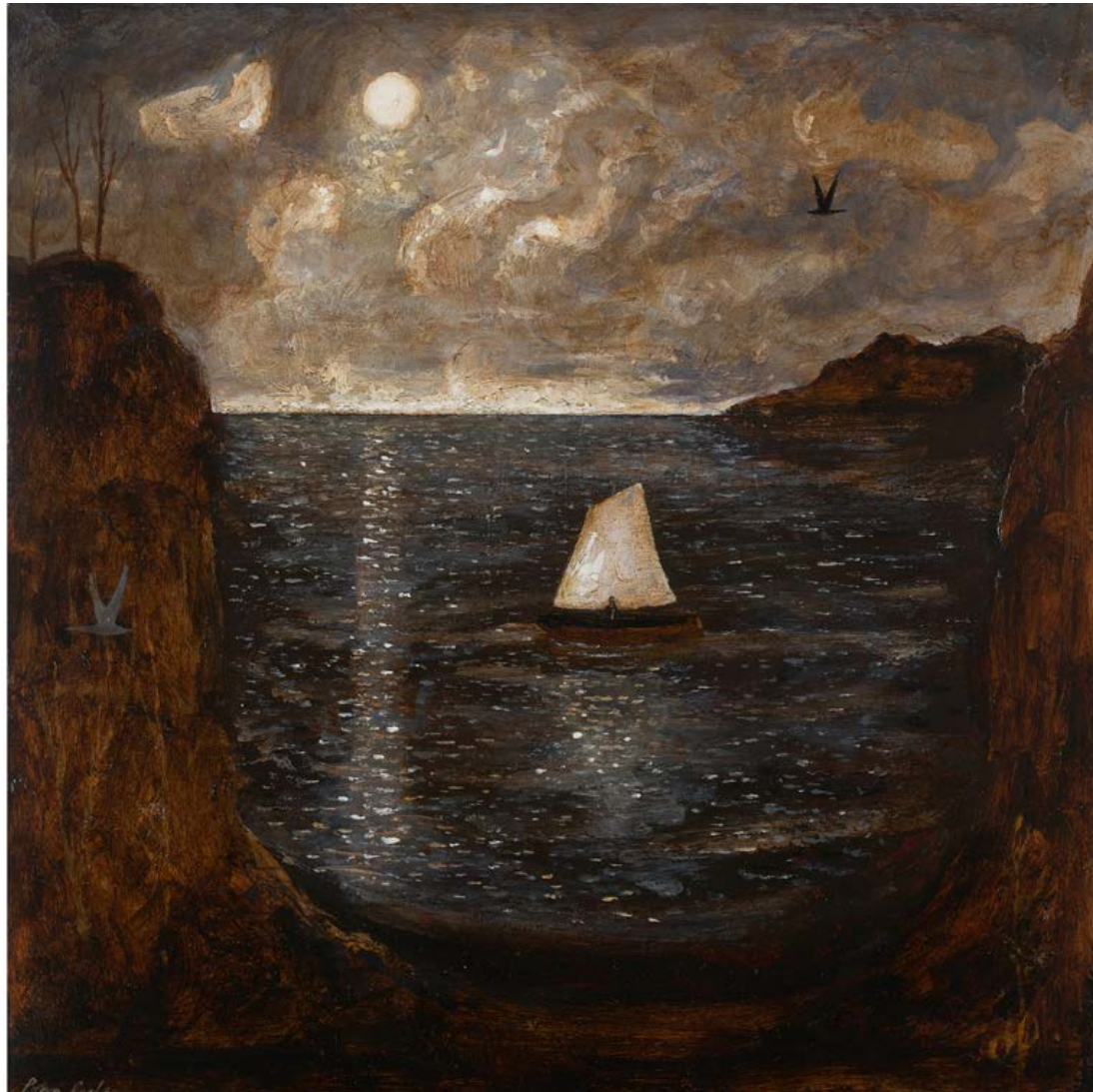
By the Deep Sea, 2021 (cat. 17) acrylic on gesso board 14 x 14 ins, 35.5 x 35.5 cms