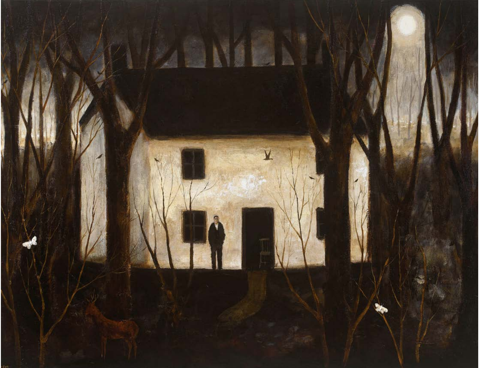
Night Vision, 2021 (cat. 5) acrylic on canvas 30 x 40 ins, 76 x 101 cms