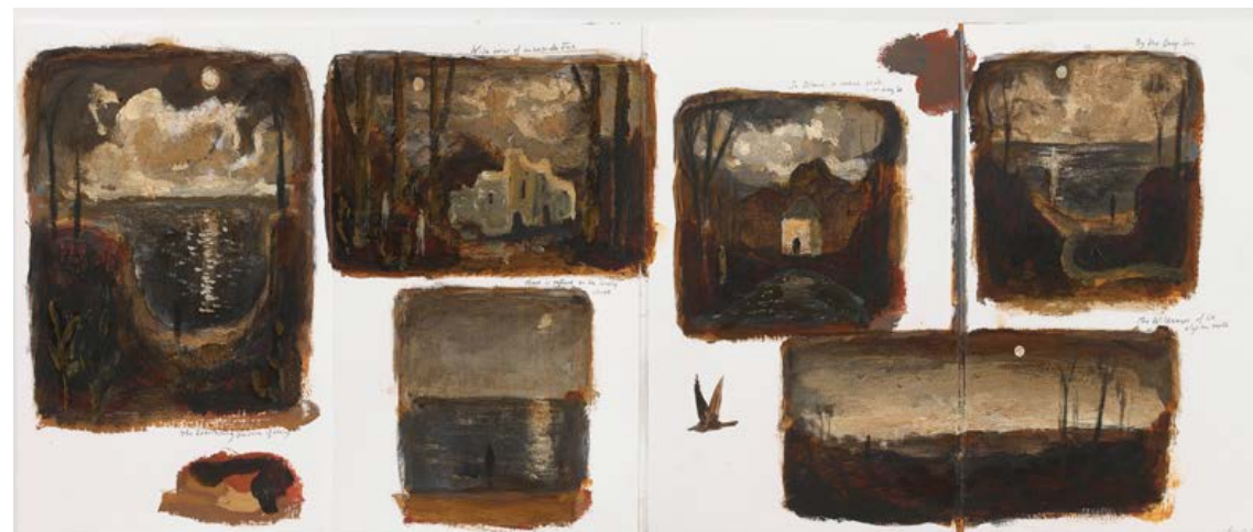
Sketch Book Pages, 2021 acrylic on paper 11½ x 16 ins, 29 x 41 cms