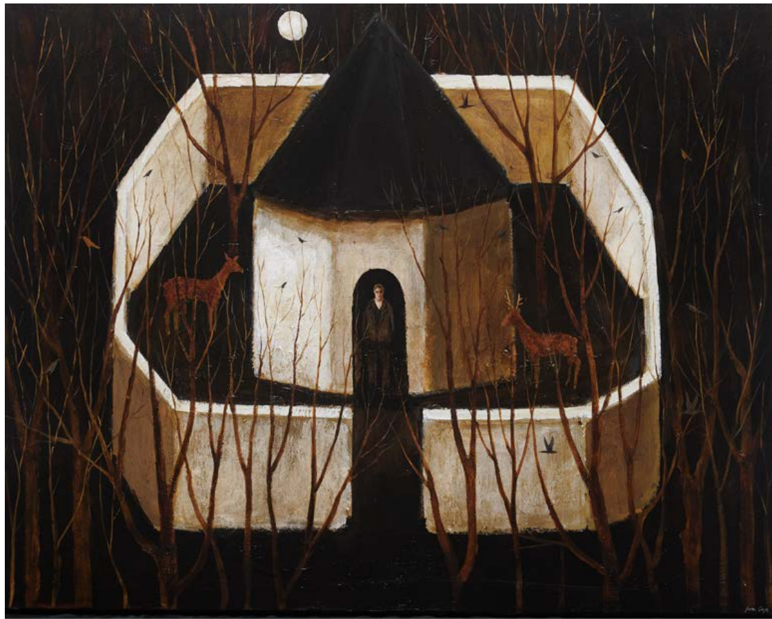
A Solitude, 2021 (cat. 15) acrylic on canvas 24 x 30 ins, 61 x 76 cms