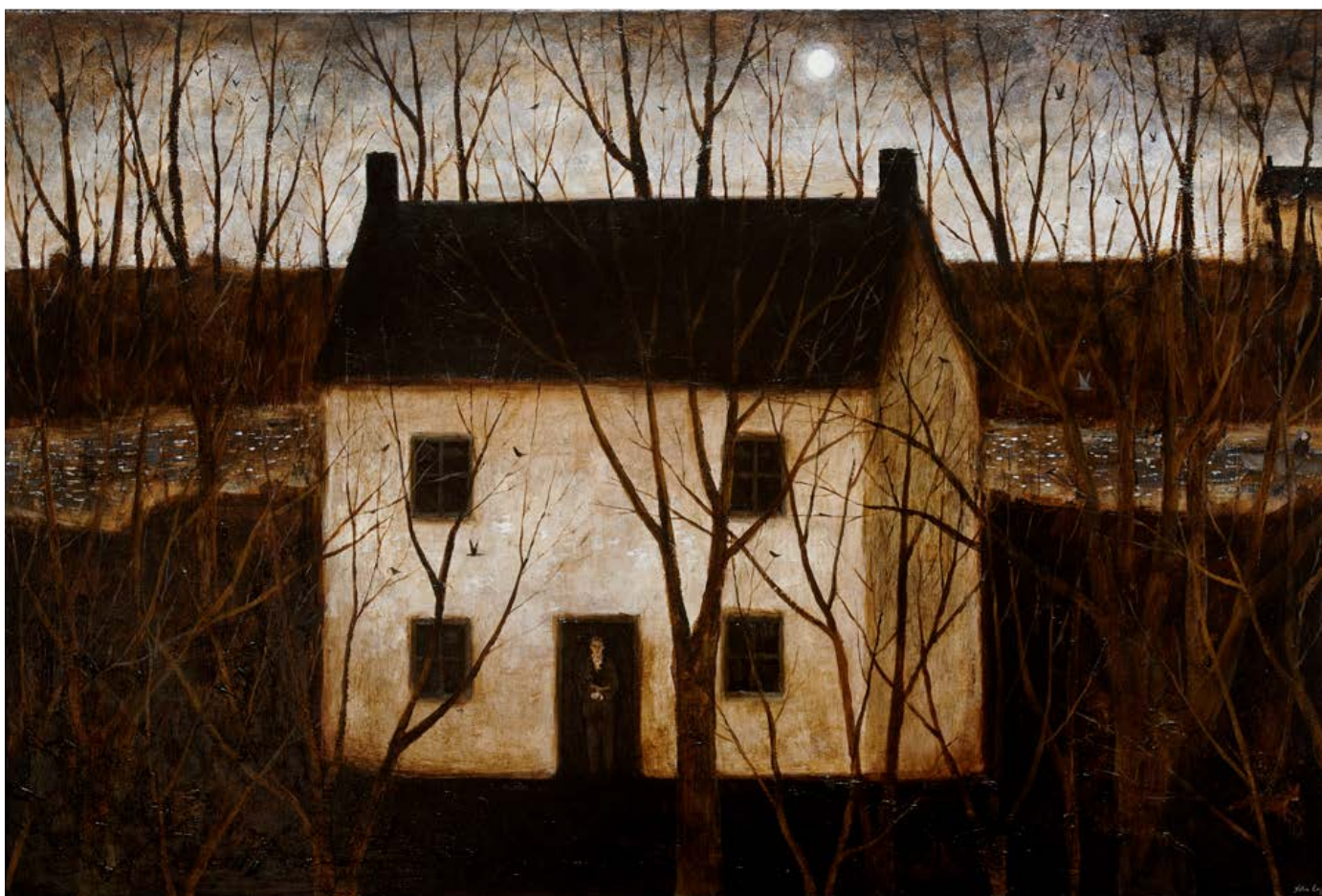
Visitor at Dusk, 2021 (cat. 23) acrylic on canvas 24 x 36 ins, 61 x 91 cms