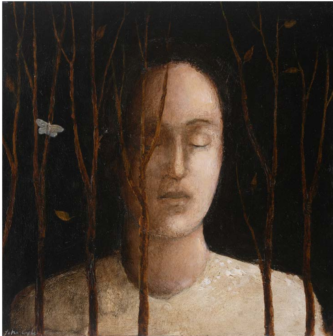
What if My Leaves are Falling like Its Own, 2021 (cat. 24) acrylic on gesso board 10 x 10 ins, 25 x 25 cms