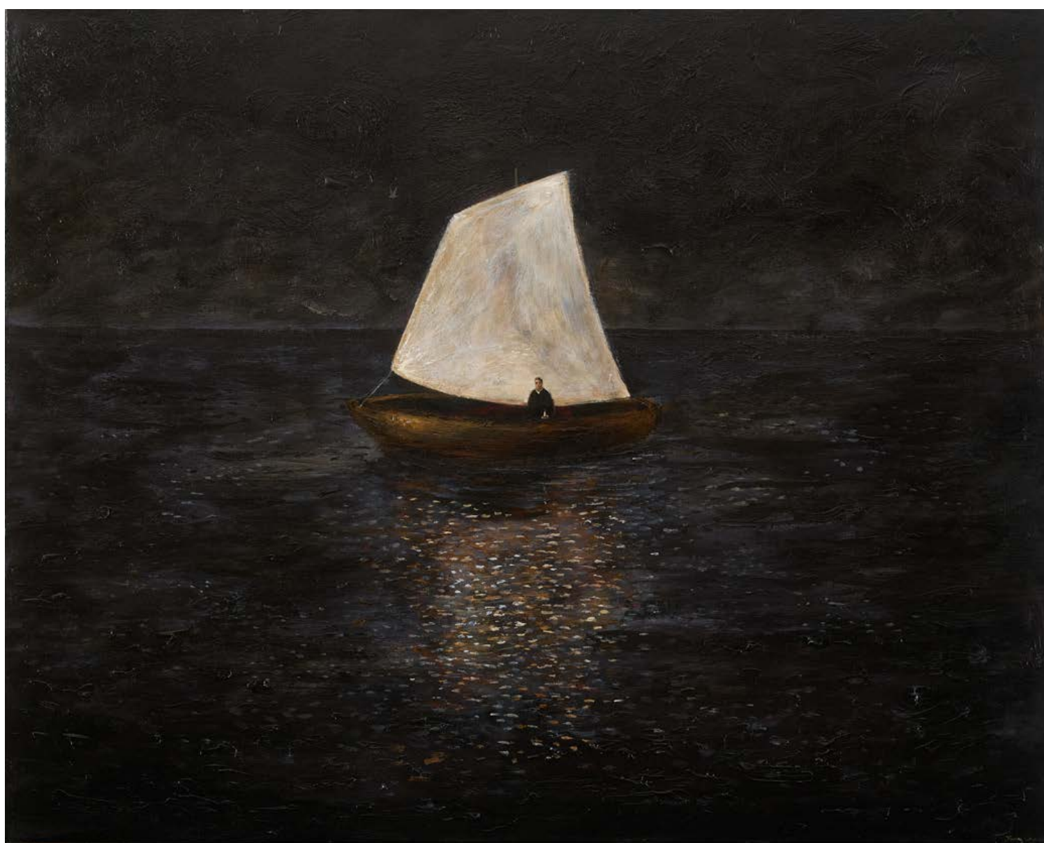
The Deep Sea, 2021 (cat.4) acrylic on canvas 24 x 30 ins, 61 x 76 cms