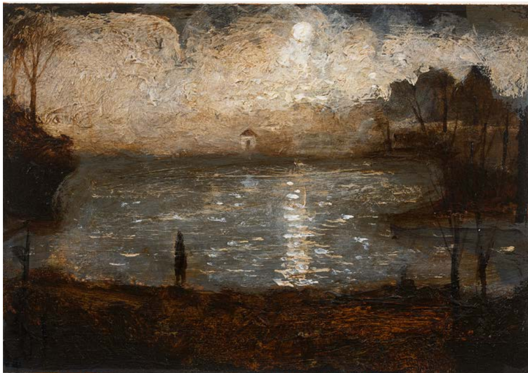
There is Rapture on the Lonely Shore, 2021 (cat. 11) acrylic on paper mounted on board 5 x 7¼ ins, 13 x 18.5 cms