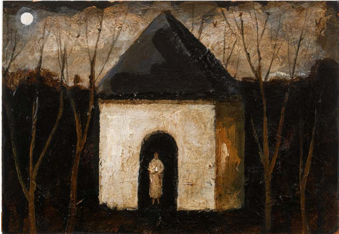
Solitude in Dusk, 2021 (cat. 35) acrylic on paper 5 x 7 ins, 12.5 x 18 cms