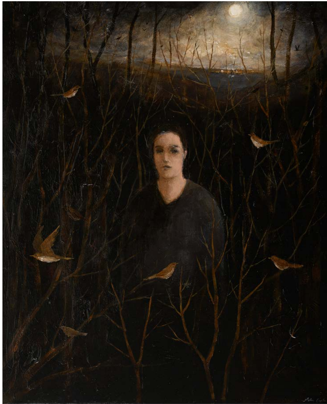
If Winter Comes Spring Can't be Far Behind, 2021 (cat. 16) acrylic on canvas 20 x 16 ins, 51 x 40.5 cms