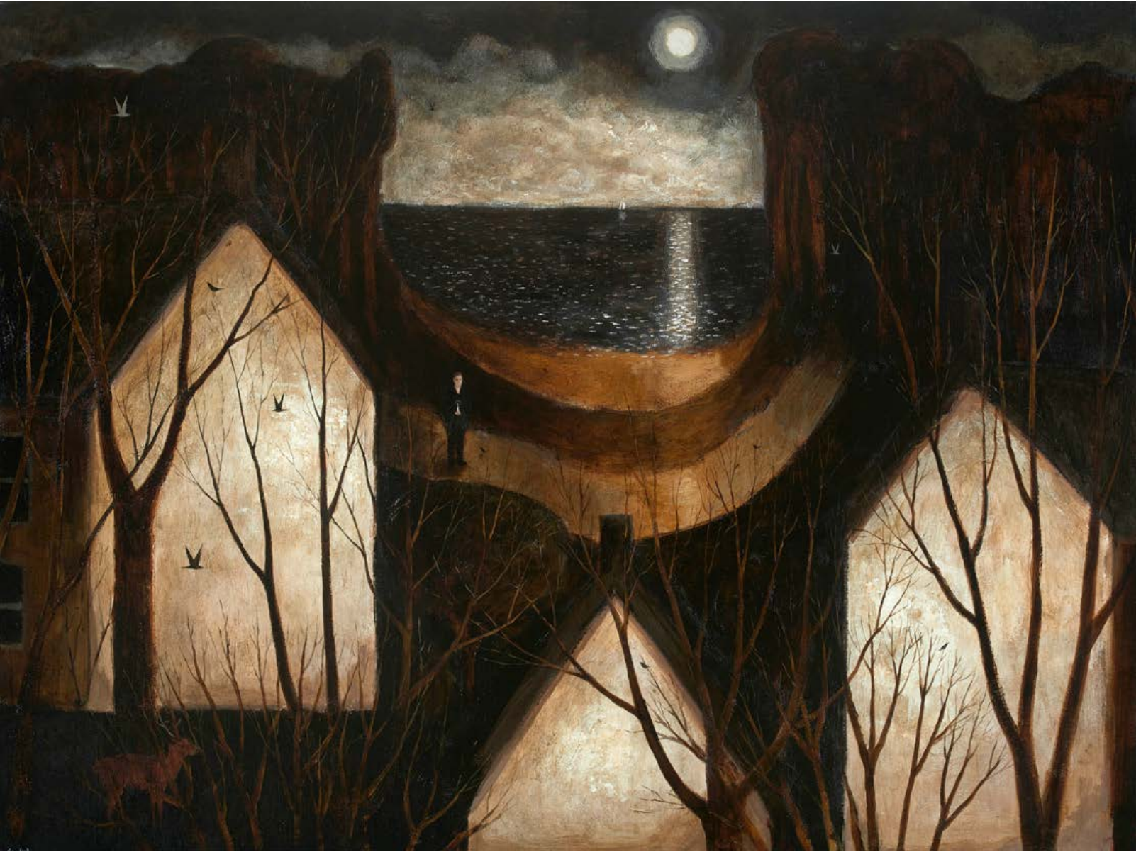
The Lonely Shore, 2021 (cat. 43) acrylic on canvas 36 x 48 ins, 92 x 122 cms