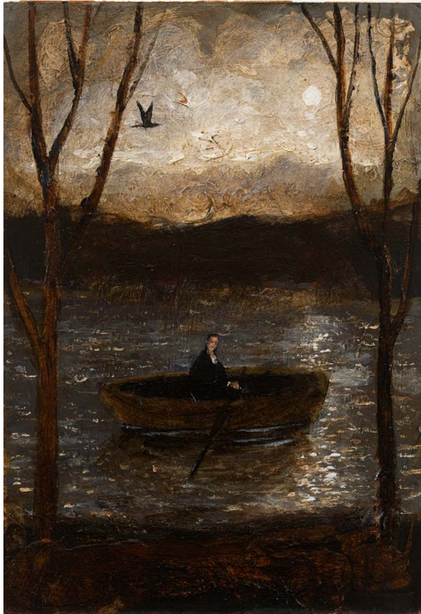
Visit the Soul in Sleep II , 2021 (cat. 26) acrylic on paper 7 x 5 ins, 18 x 13 cms