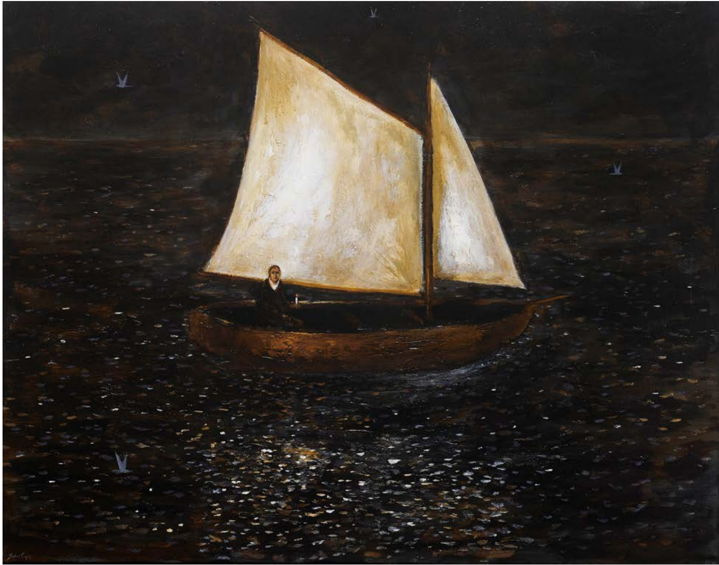
To Visit the Soul, 2021 (cat. 20) acrylic on canvas 24 x 30 ins, 61 x 76 cms