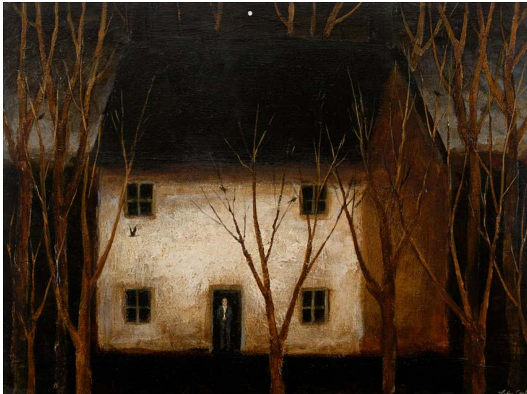
In the Woods , 2021 (cat. 19) acrylic on linen on board 11¾ x 15¾ ins, 30 x 40 cms