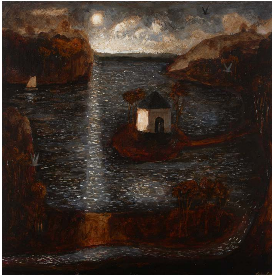
A Solitude, A Refuge, II, 2021 (cat. 9) acrylic on gesso board 14 x 14 ins, 35.5 x 35.5 cms