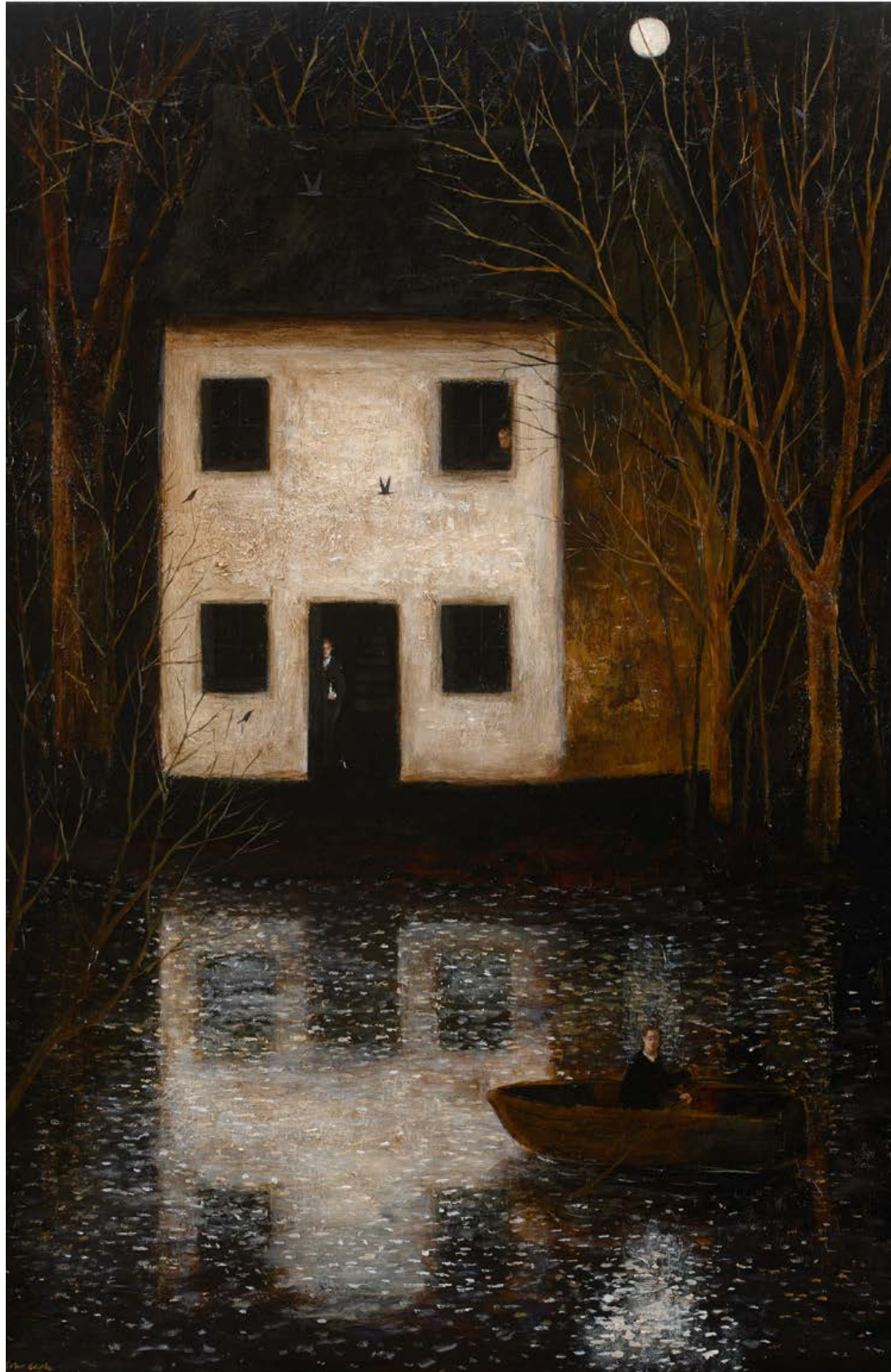
Visit the Soul in Sleep I, 2021 (cat. 21) acrylic on canvas 36 x 24 ins, 91.5 x 61 cms