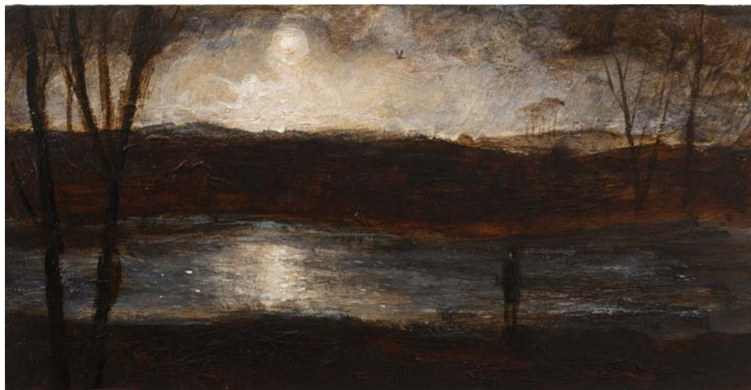
Now Dark, Now Glittering, Now Reflecting Gloom I, 2021 (cat. 37) acrylic on paper mounted on board 6 x 11½ ins, 15 x 29 cms