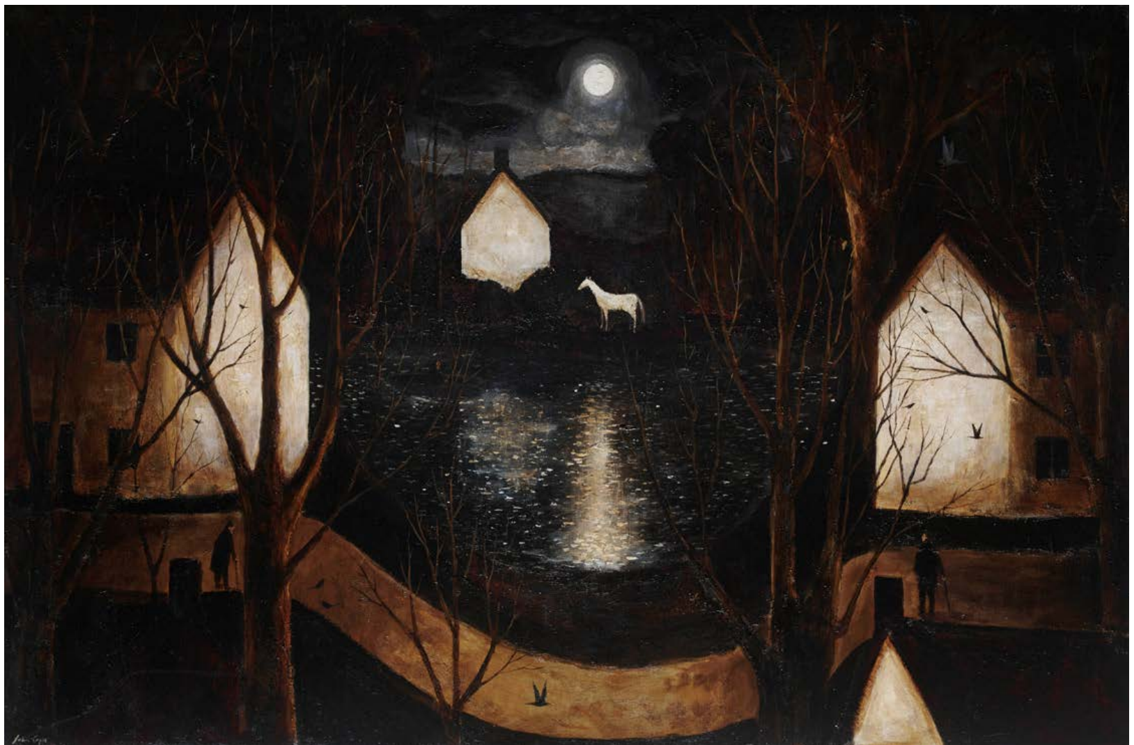
The Sojourn, 2021 (cat. 2) acrylic on canvas 24 x 36 ins, 61 x 91.5 cms