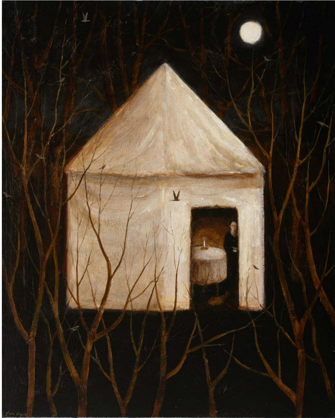
The Wilderness has a Mysterious Tongue , 2021 (cat. 3) acrylic on canvas 20 x 16 ins, 51 x 40.5 cms