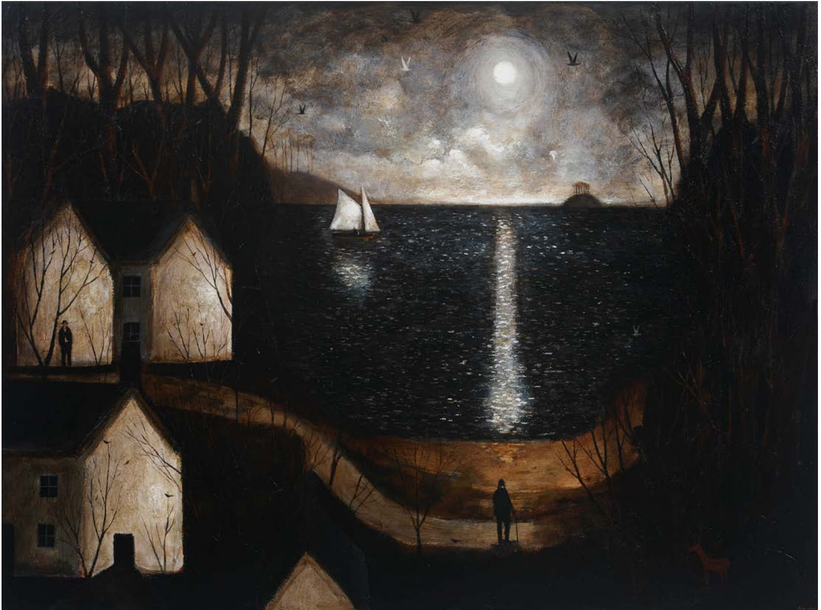
The Pathless Woods, 2021 (cat. 1) acrylic on canvas 30 x 40 ins, 76 x 101 cms