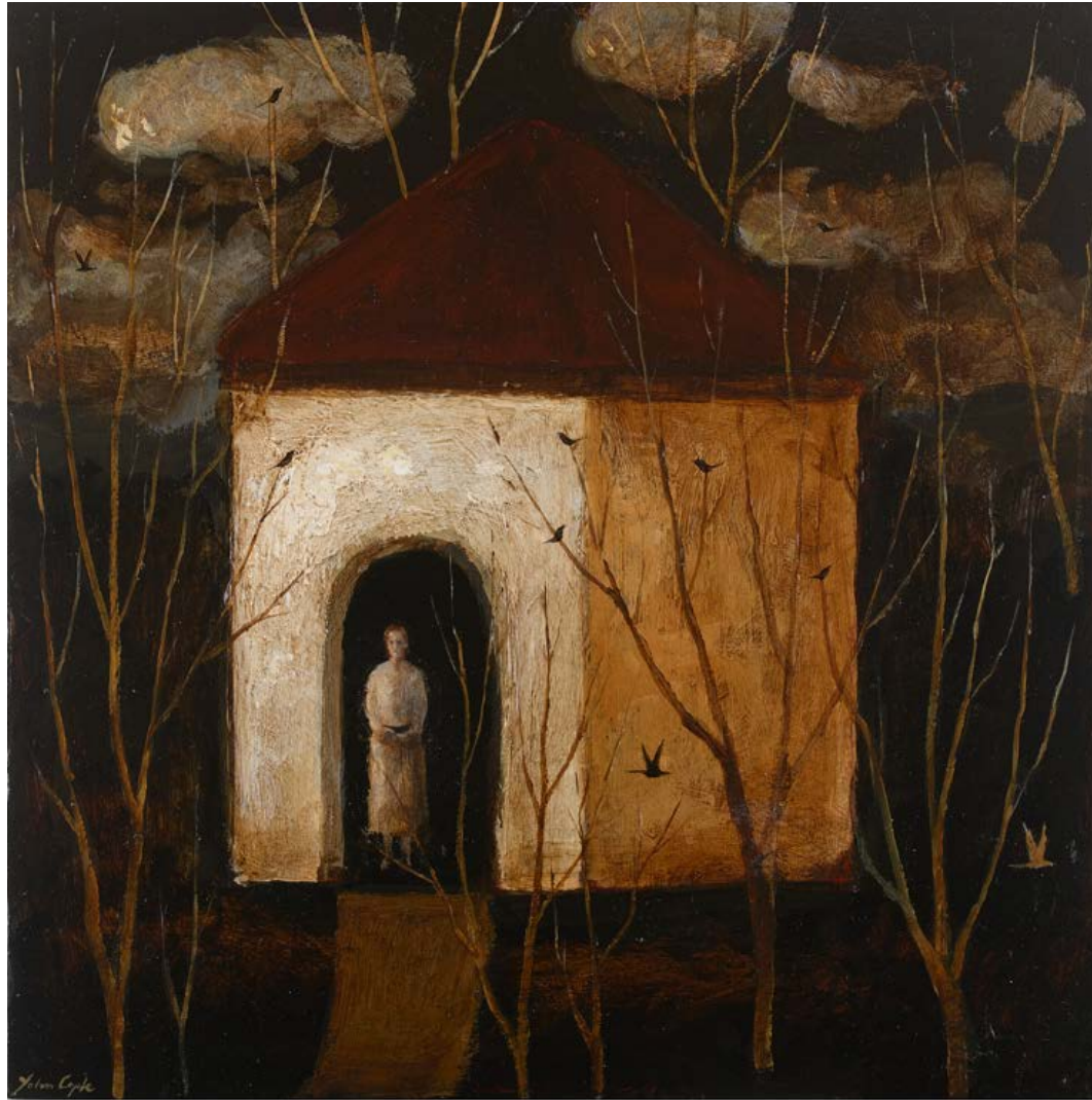
Solitude at Dusk, 2021 (cat. 40) acrylic on gesso board 10x 10 ins, 25.5 x 25.5 cms