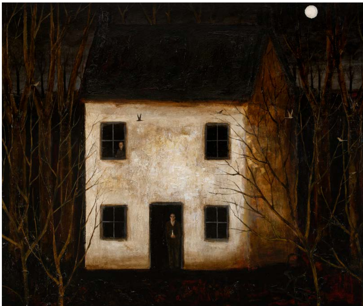
The Gleam of a Remoter World, 2021 (cat. 7) acrylic on canvas 24 x 30 ins, 61 x 76 cms