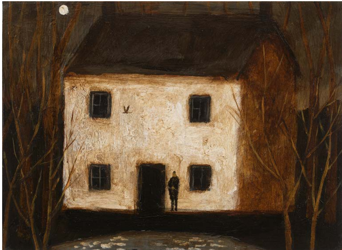
There is Pleasure in the Pathless Woods, 2021 (cat. 10) acrylic on paper mounted on board 6 x 8 ins, 15 x 20.5 cms