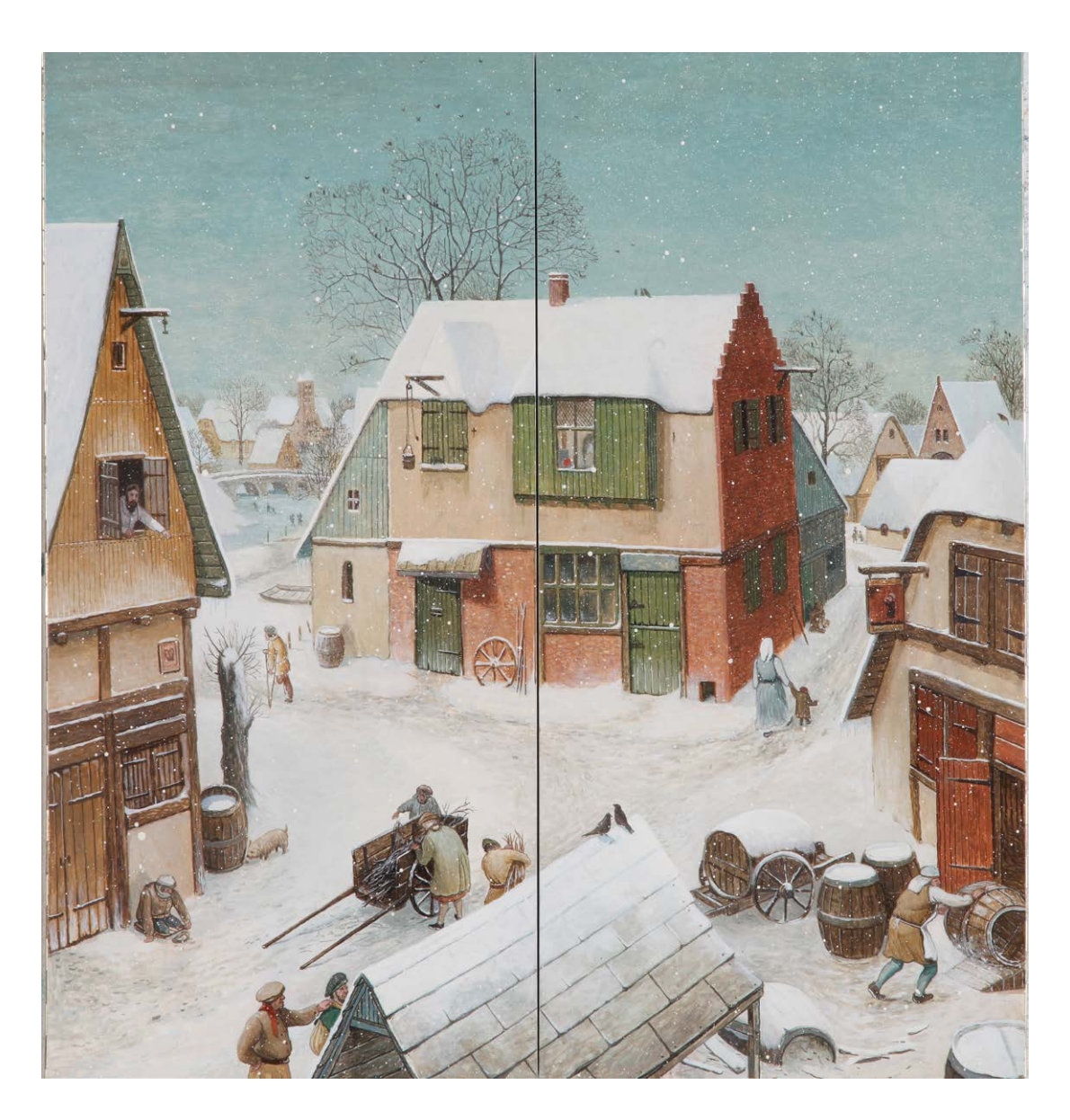
The House of Breugel Oil on folding panel 24 x 24 ins (closed) 24 x 48 ins (open)