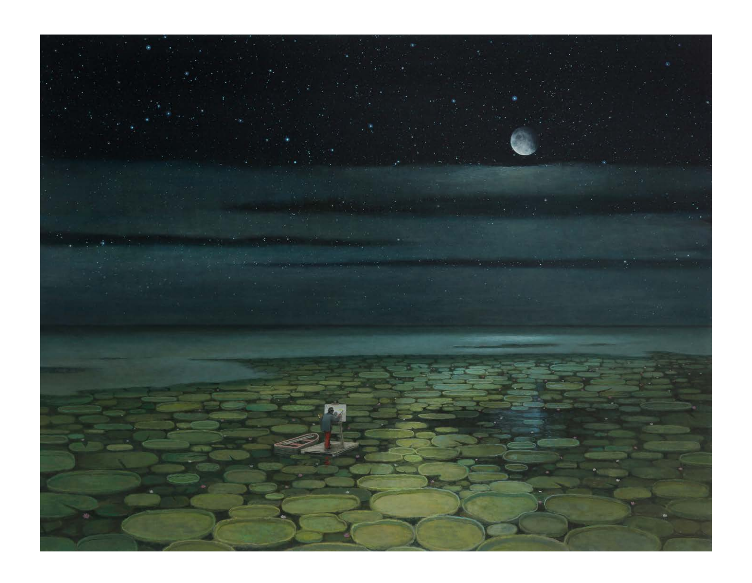
- Eternity Oil on canvas 38 x 48 ins