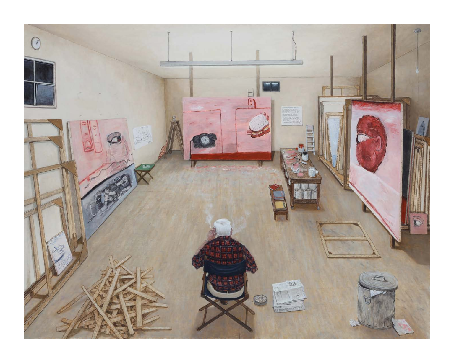
— Anxiety Oil on canvas 38 x 48 ins