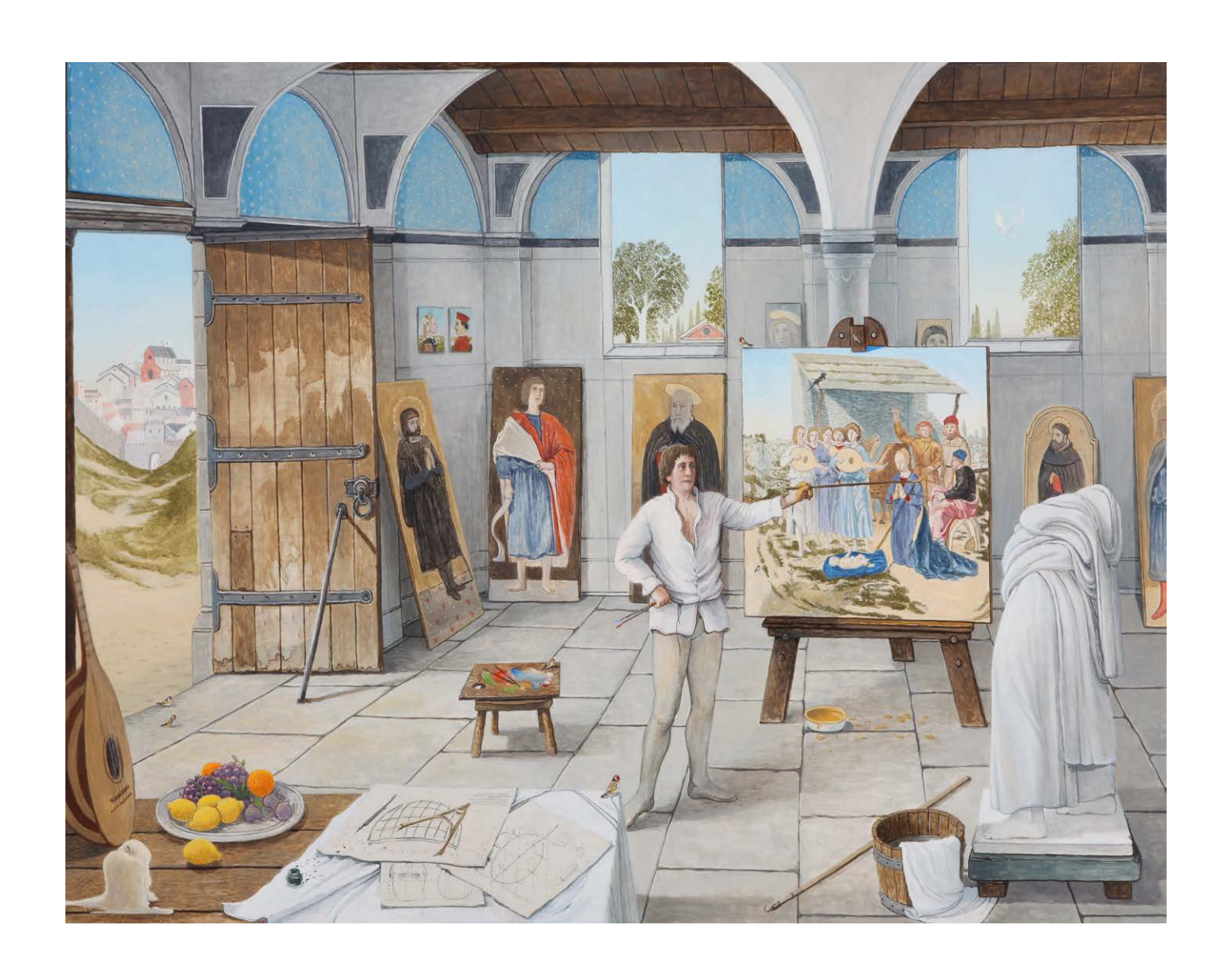
— Sacred Conversation Oil on panel 24 x 31½ ins