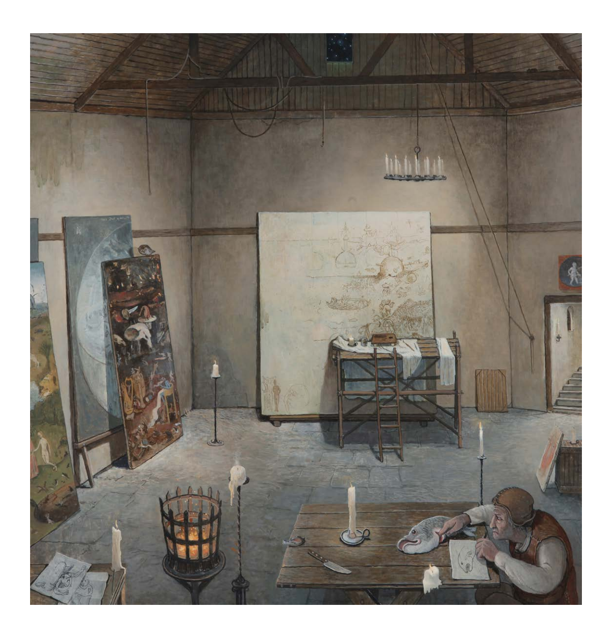
— The Medieval Mind Oil on panel 24 x 24 ins