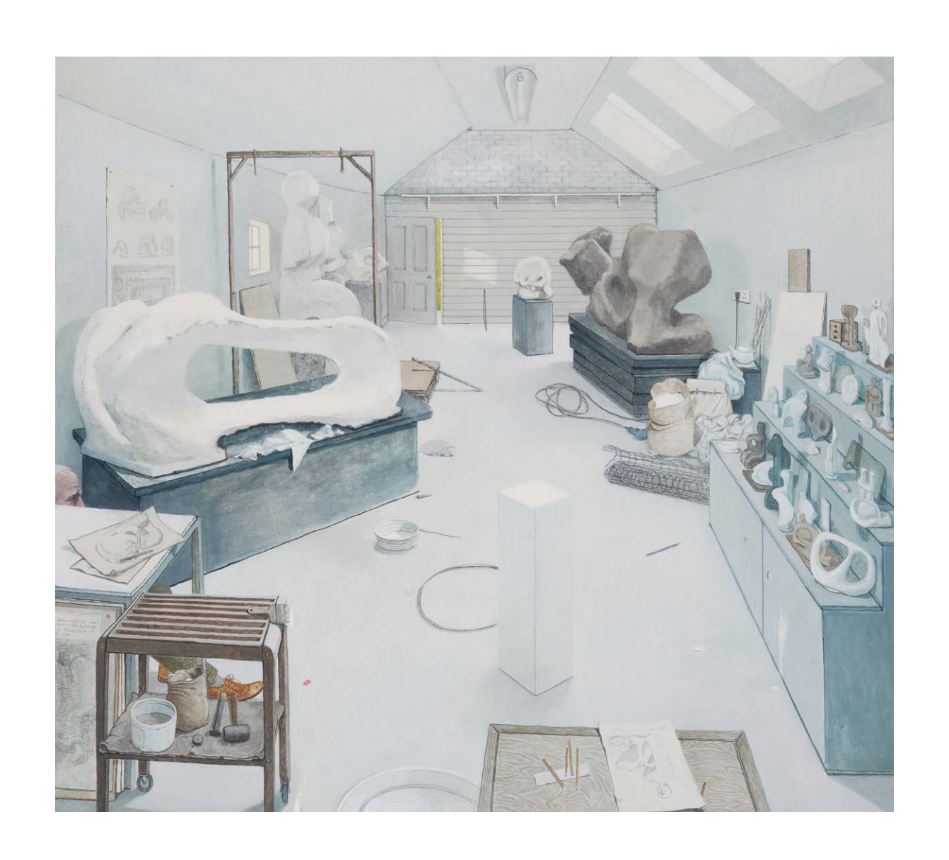
— Endless Forms Oil on canvas 30 x 34 ins