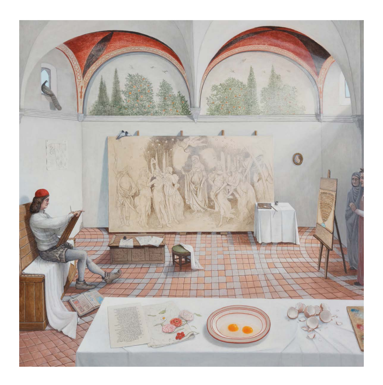
— To Every Captive Soul and Gentle Heart Oil on canvas 37 x 37 ins