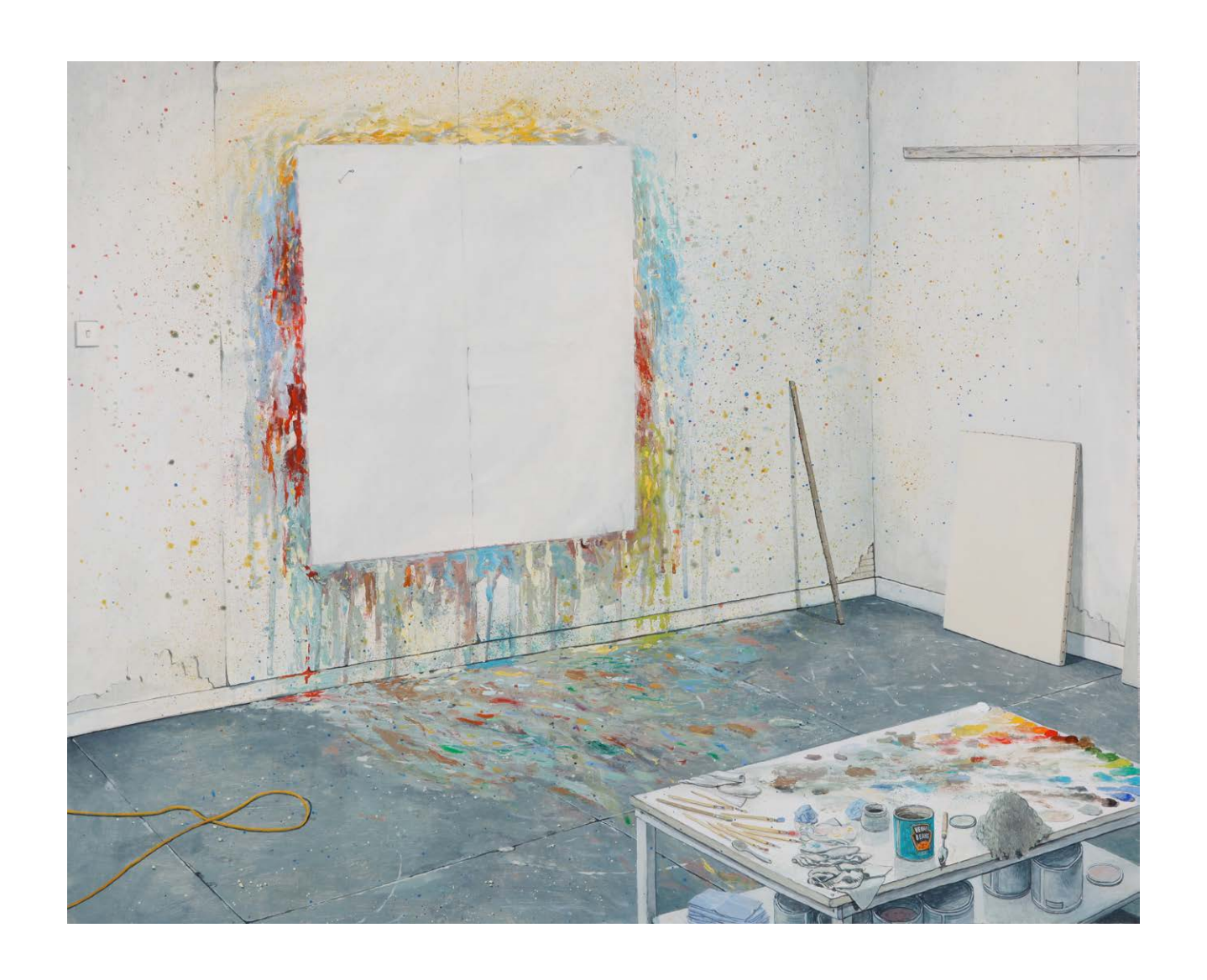
— The Hole Oil on canvas 24 x 28 ins