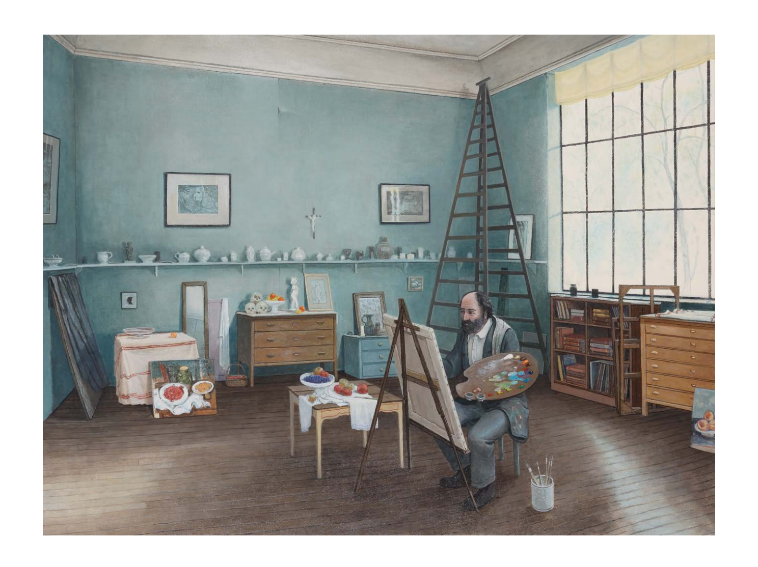
— The Father Oil on canvas 30 x 40 ins