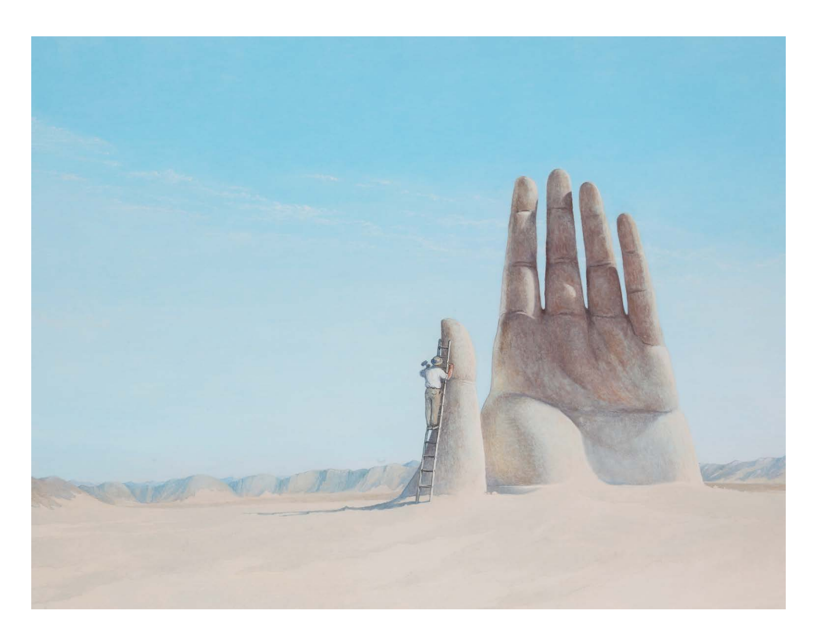
— The Monument Oil on canvas 30 x 34 ins