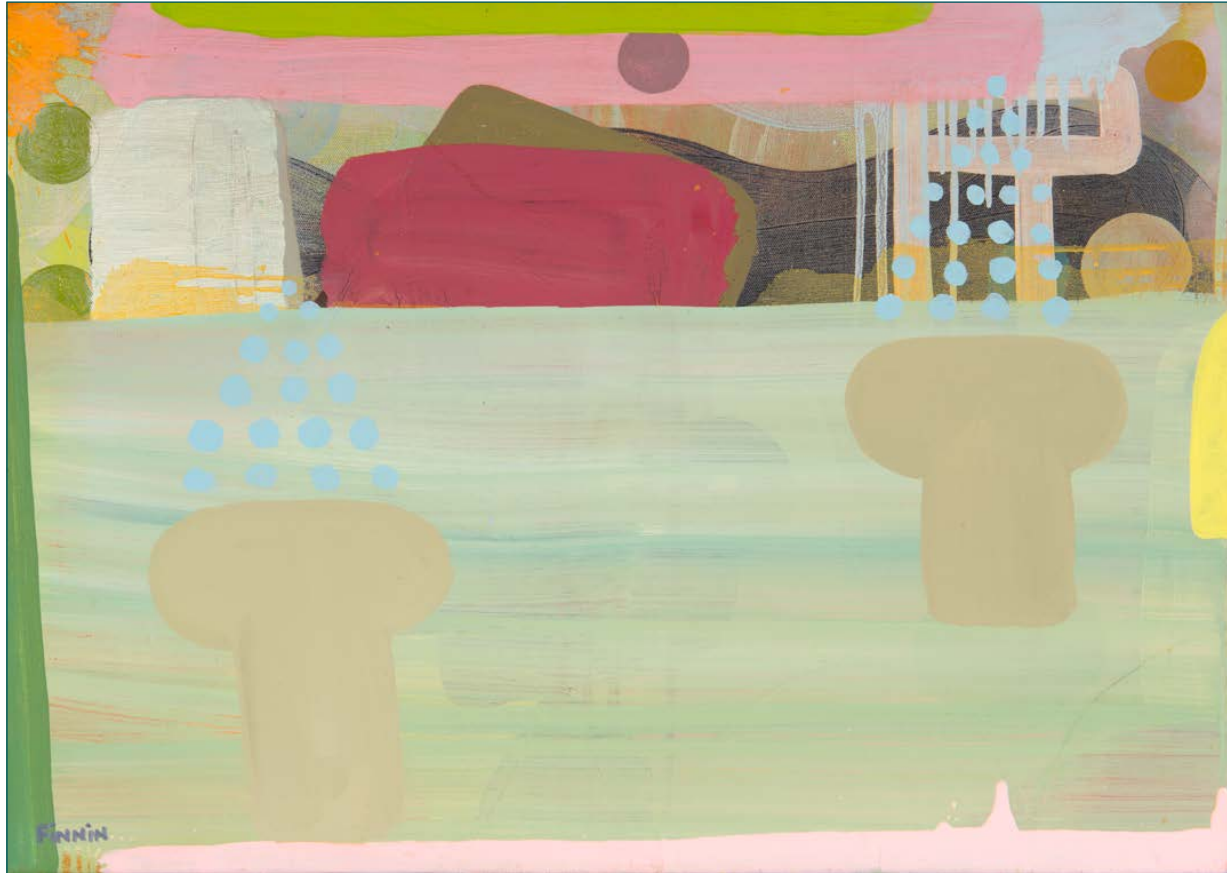
Knowledge Drying on the Bank , oil on canvas, 19½ x 27½ inches, 50 x 70 cms