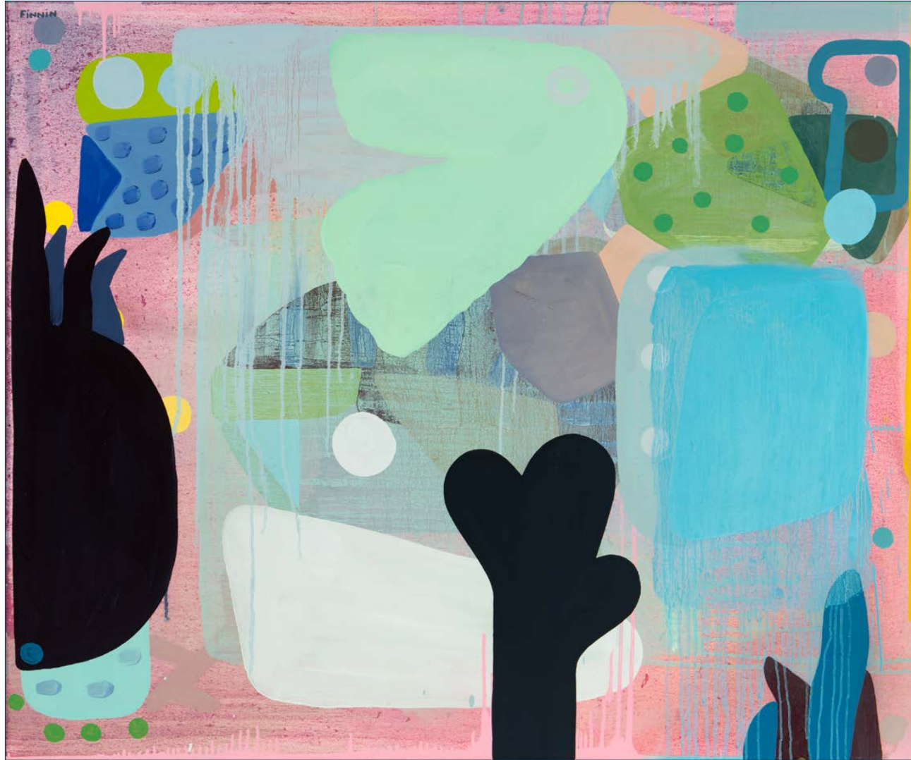
The Owl Locked the Forest with a Big Key , oil on canvas, 39¼ x 47¼ inches, 100 x 120 cms