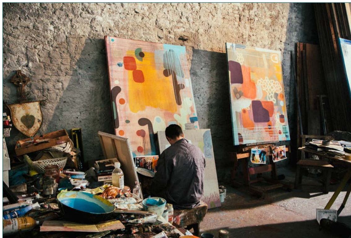
Final stages of 'The God of High Waves' and 'The Longest Lifespan of Blue', Cork 2014