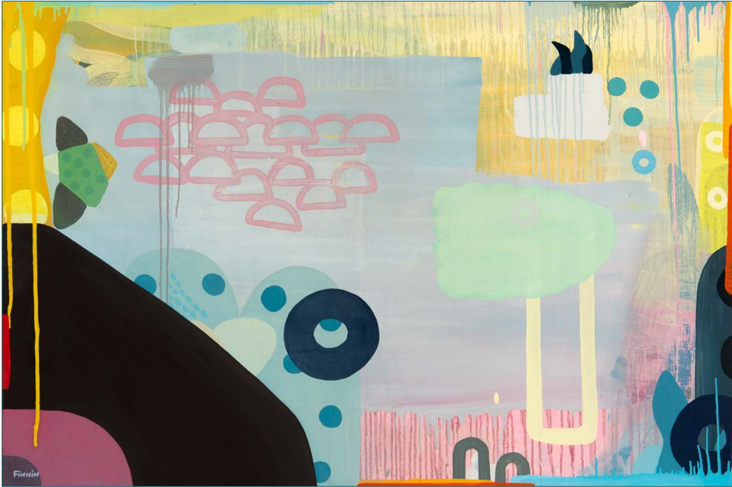
The Wolf, The Woodpecker and the Wannabee , oil on canvas, 39¼ x 59 inches, 100 x 150 cms