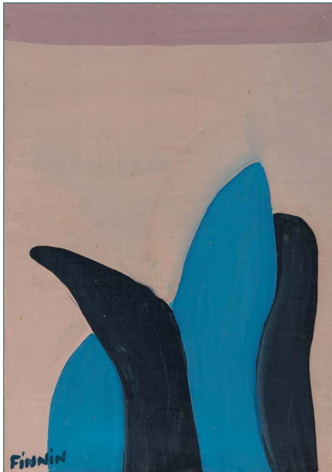
Metal Shape on Trasu De Ciuc, oil on canvas, 12 x 18 inches, 30 x 20 cms