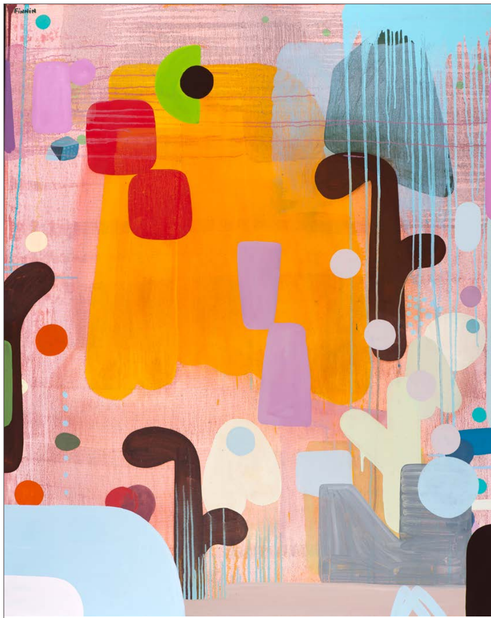
The God of High Waves , oil on canvas, 59 x 47¼ inches, 150 x 120 cms