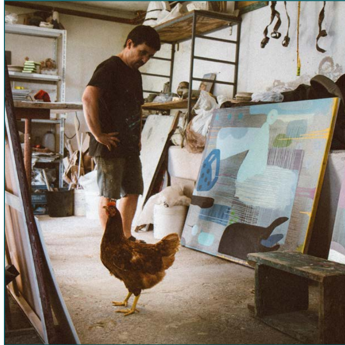
In the studio, Lucca, summer 2014