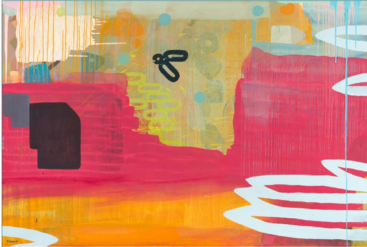
Flight of the Florentine Cube , oil on canvas, 47¼ x 70¼ inches, 120 x 180 cms