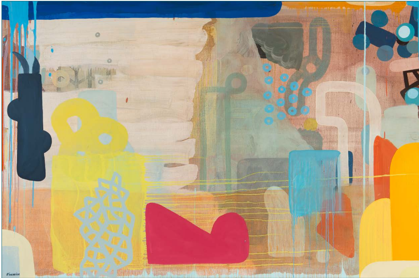
Fruits of Fair Game , oil on canvas, 47¼ x 70 inches, 120 x 180 cms