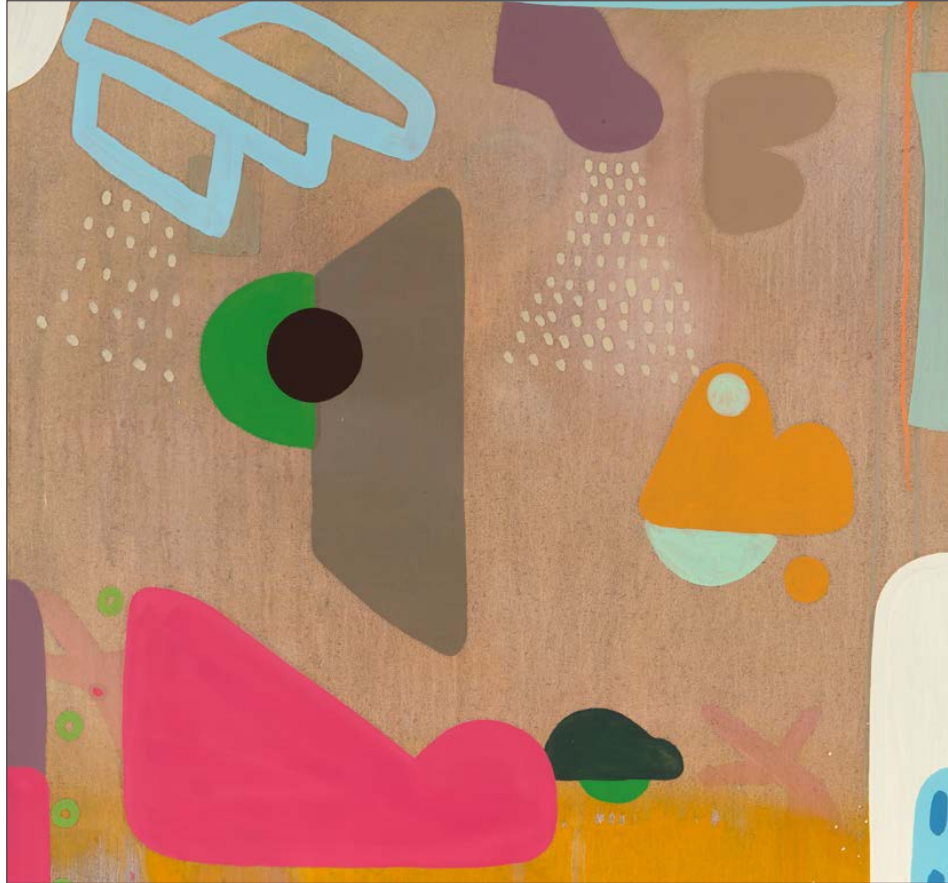
Then Pink Became Illegal , oil on canvas, 39¼ x 39¼ inches, 100 x 100 cms