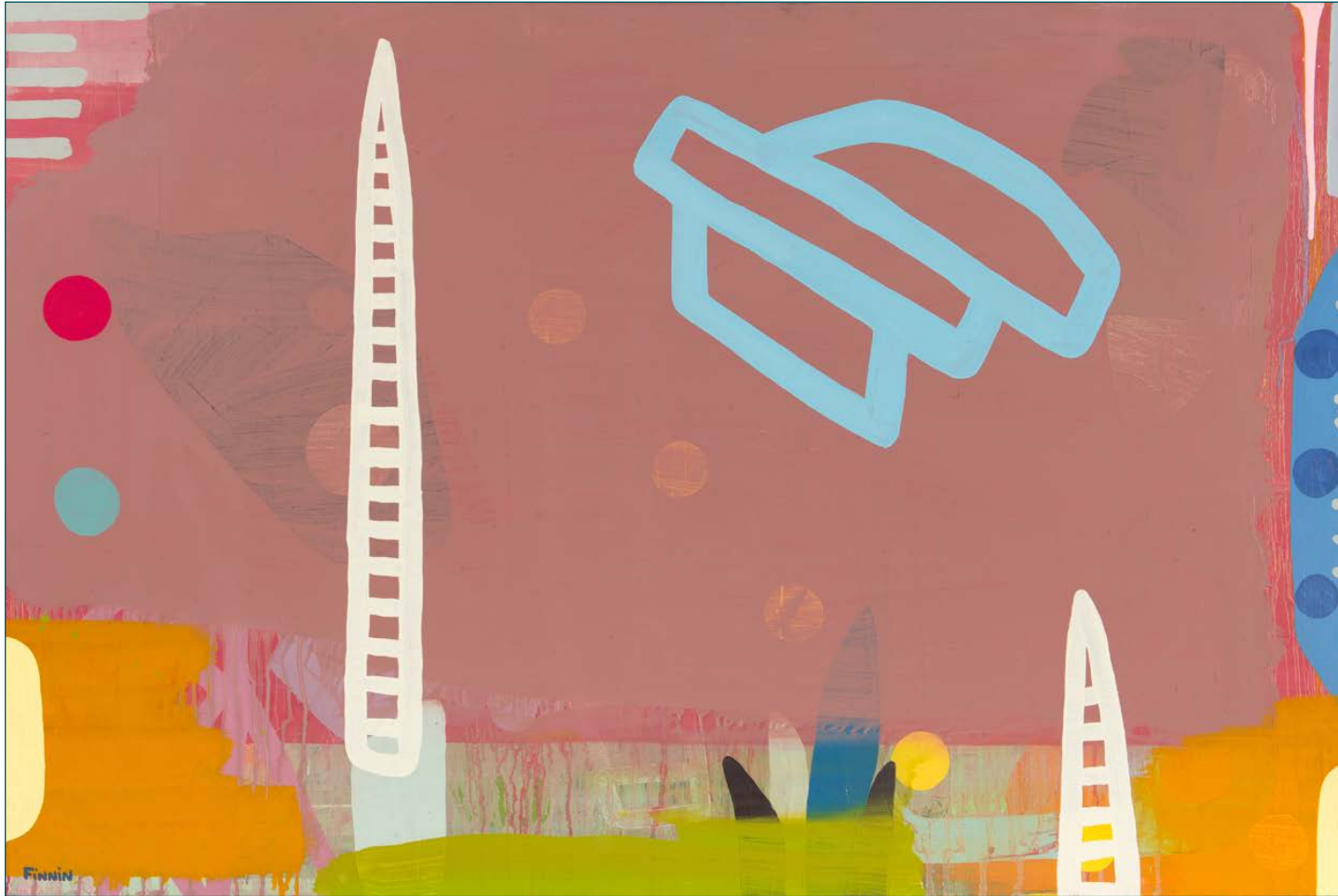
Inflatable Thought Approaching , oil on canvas, 31½ x 47¼ inches, 80 x 120 cms