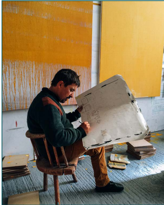
Drawing in the studio: in the background the early stages of 'God of High Waves' and 'The Longest Lifespan of Blue'