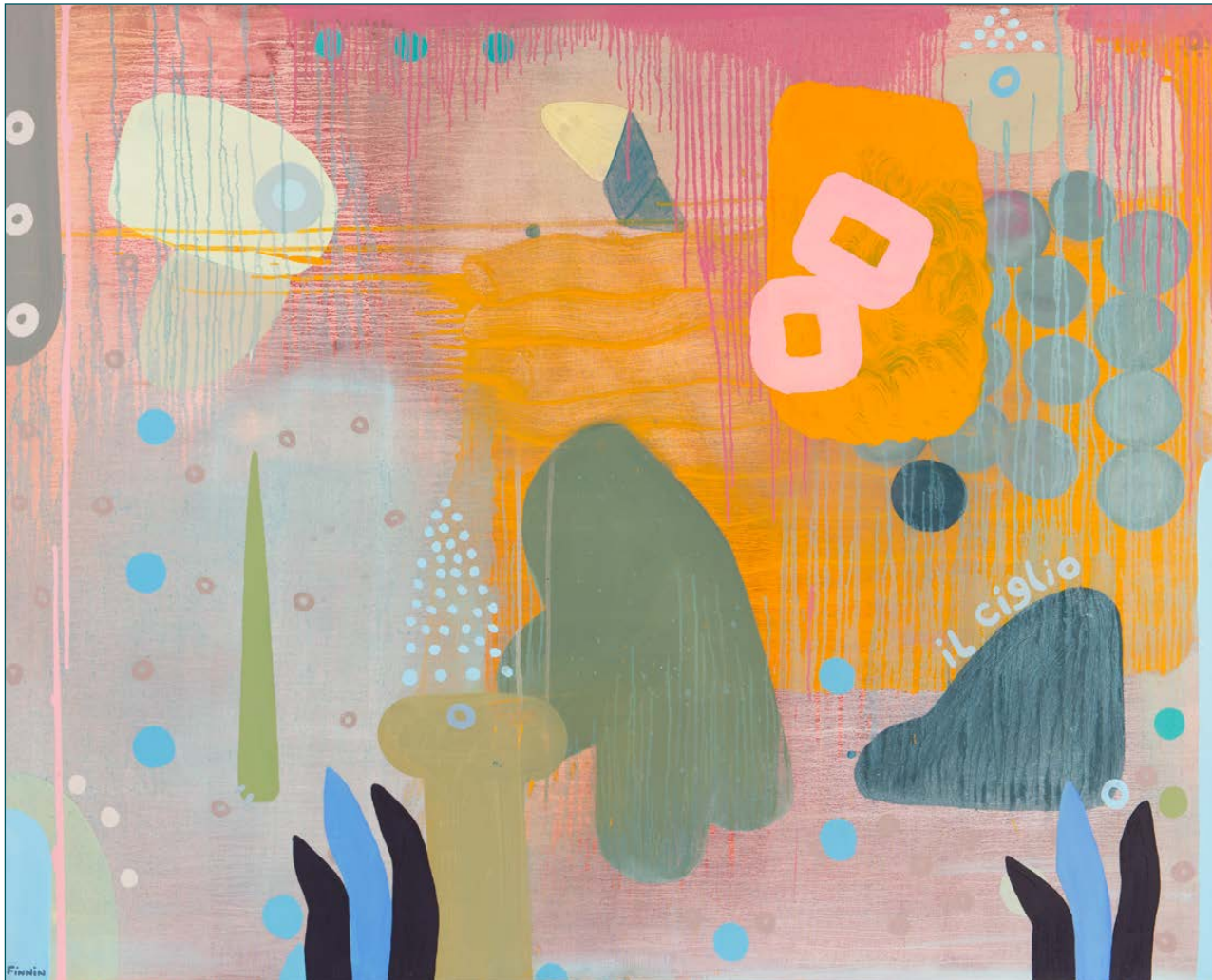
Low Fat Pink Climbing an Olive Tree , oil on canvas, 47¼ x 59 inches, 120 x 150 cms