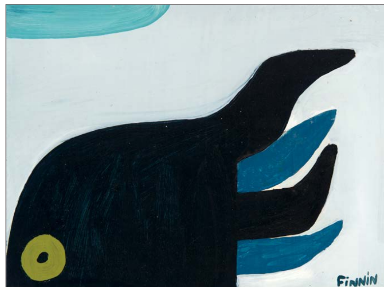
Study of a Fast Chicken , oil on linen on board, 7¼ x 11¼ inches, 20 x 30 cms