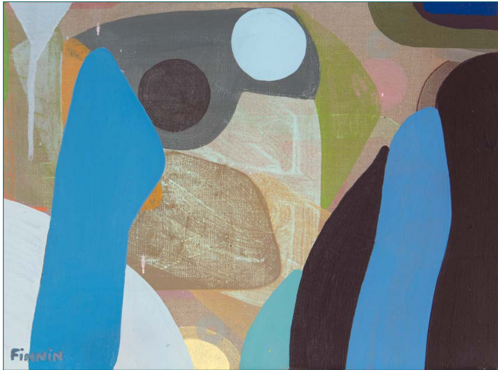
View from Studio (Italy, Night Time) , oil on canvas, 12 x 15¼ inches, 30 x 40 cms