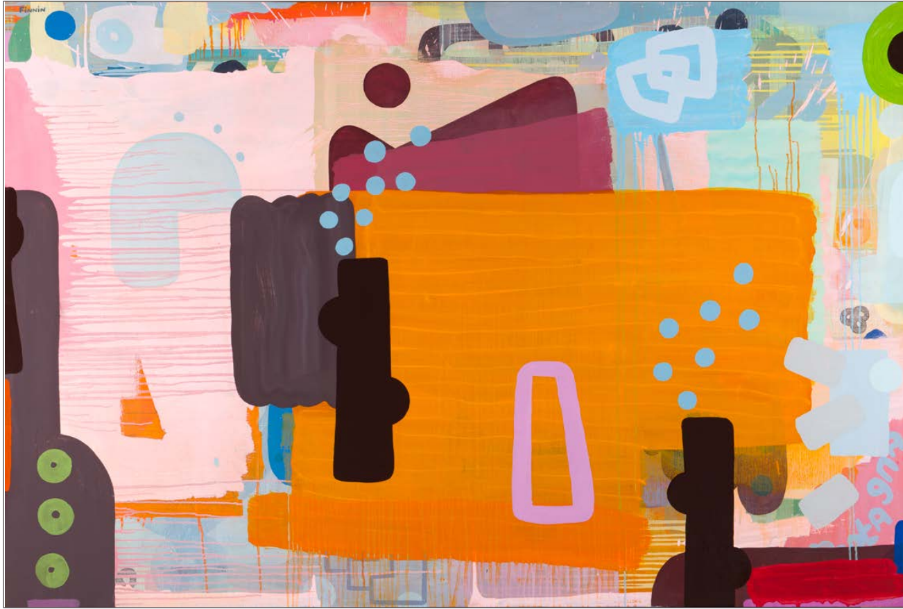
The Wolf of Eyelash Mountain , oil on canvas, 47 x 70 inches, 120 x 180 cms