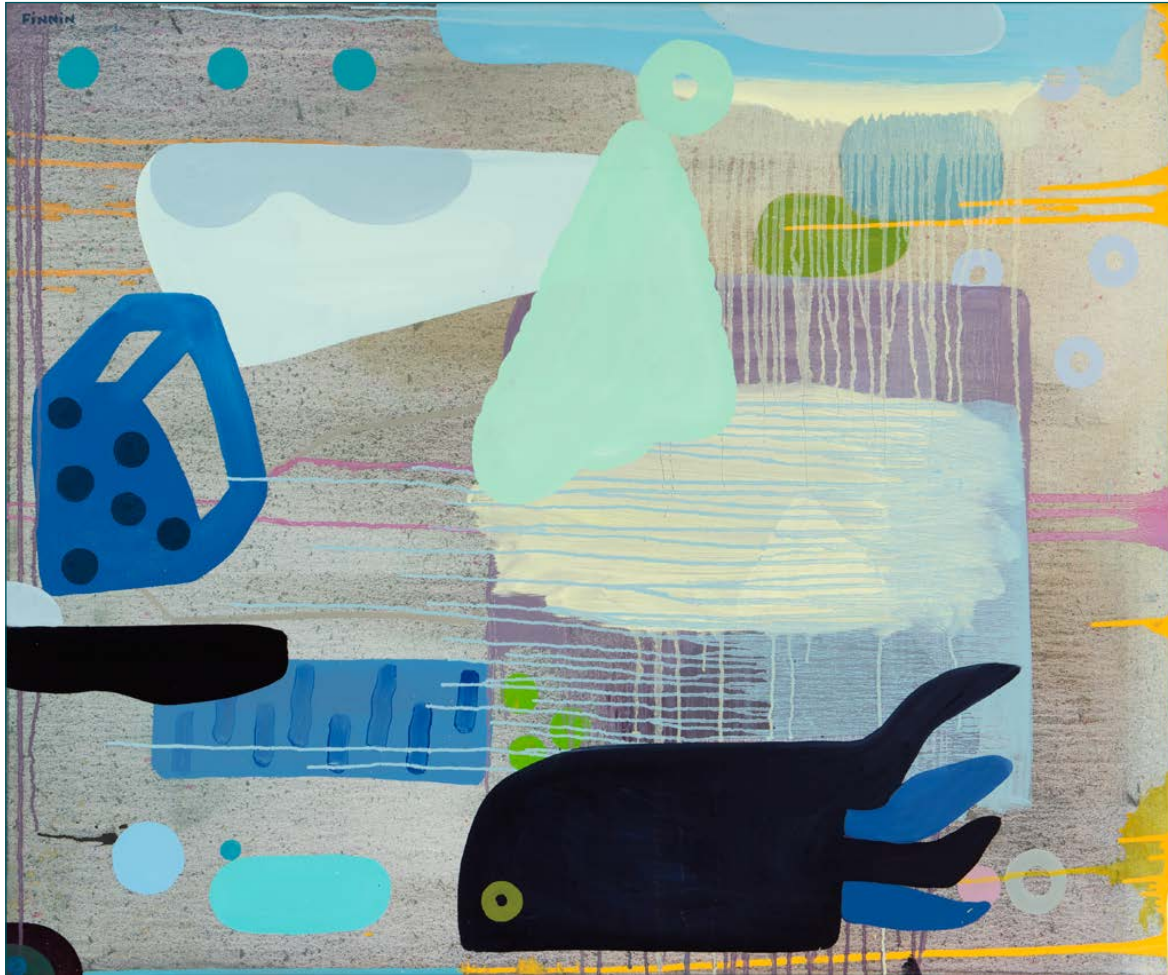
Hunt for the Modern Moment , oil on canvas, 39¼ x 47¼ inches, 100 x 120 cms