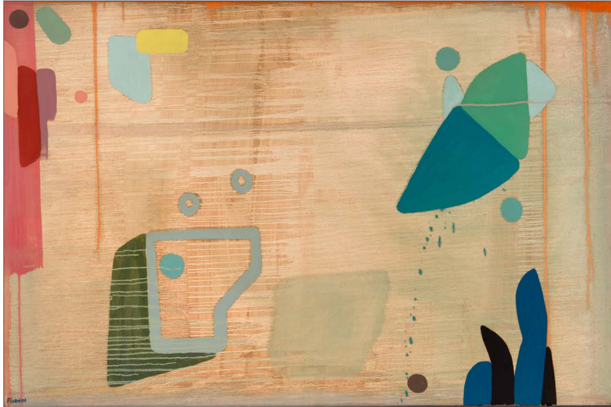
The World Shapes a Truth , oil on canvas, 39¼ x 59 inches, 100 x 150 cms