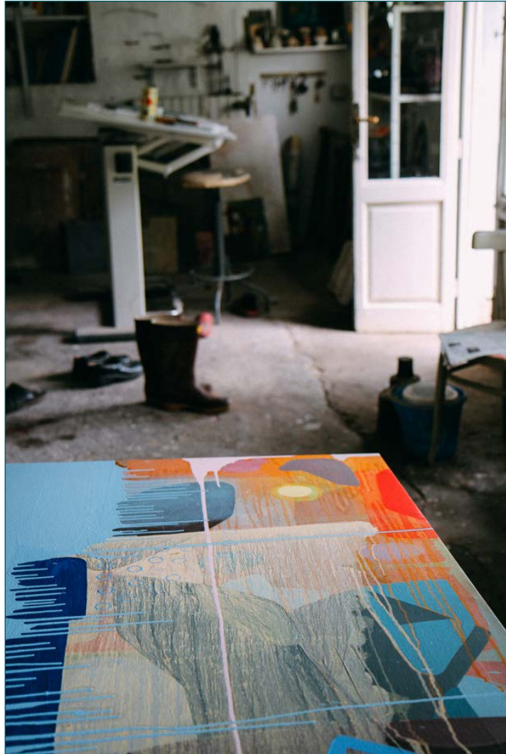
Studio Lucca, summer 2014.