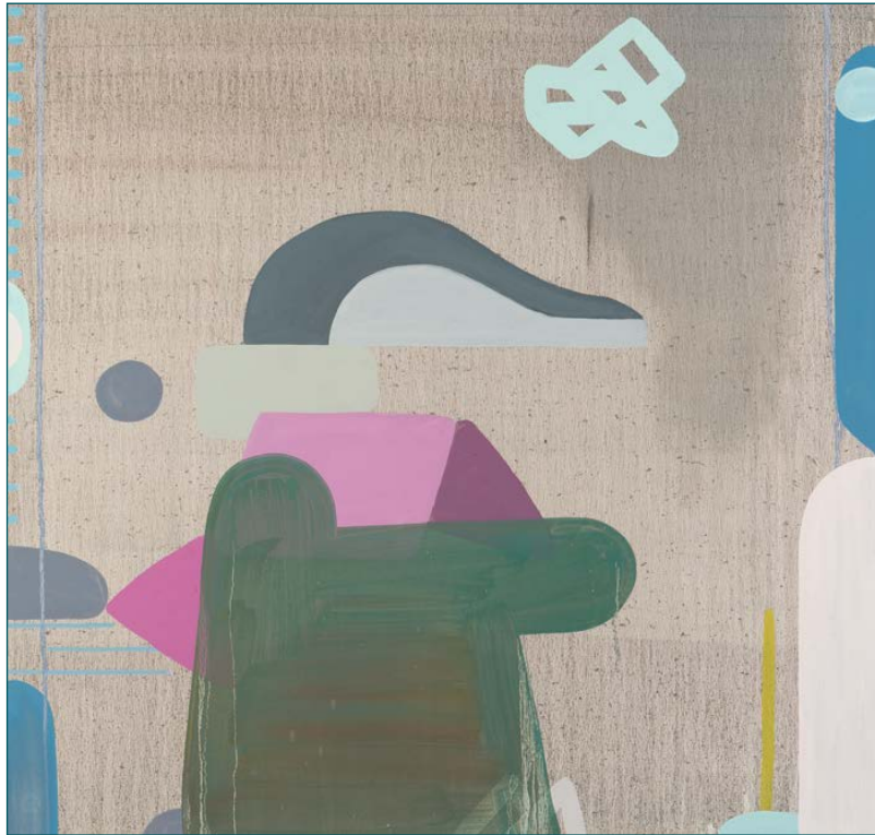
In View of What Might Have Been , oil on canvas, 39¼ x 39¼ inches, 100 x 100 cms