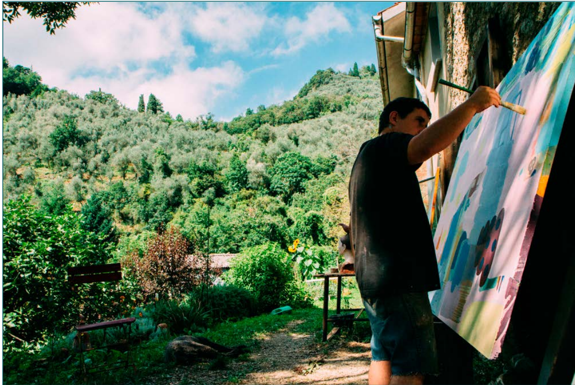
Painting in Lucca, summer 2014.