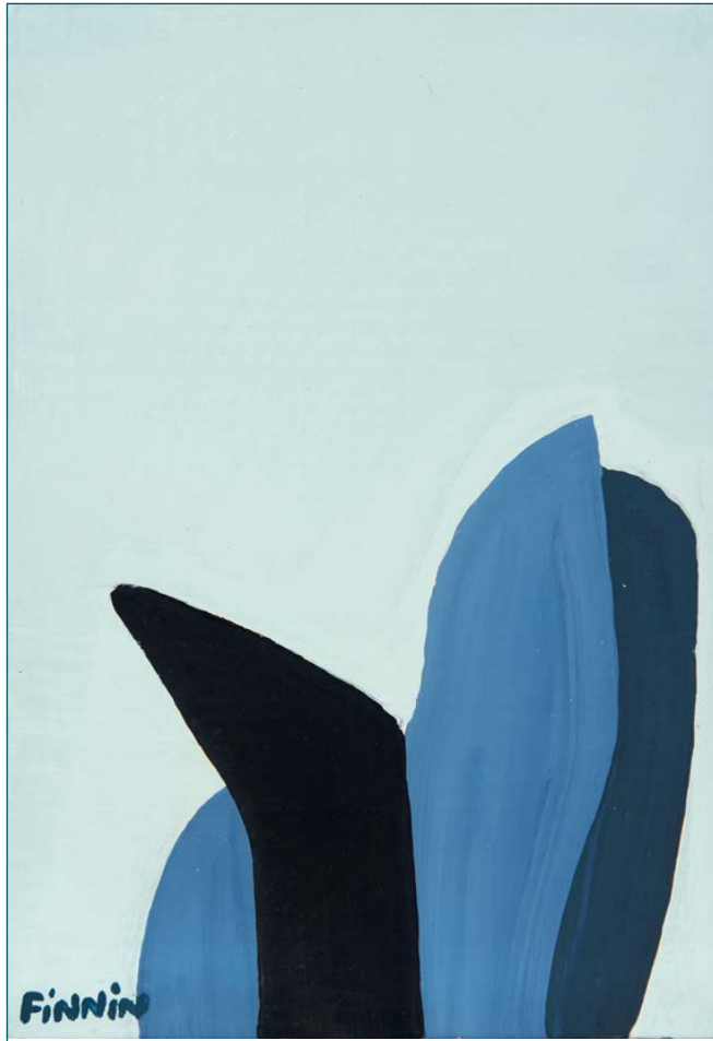
Metal Shape on Sky Blue, oil on canvas, 12 x 18 inches, 30 x 20 cms