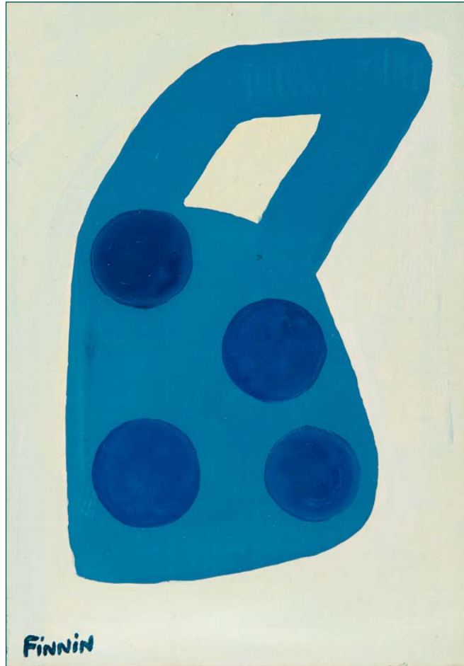
The Olive Bag , oil on canvas, 12 x 18 inches, 30 x 20 cms