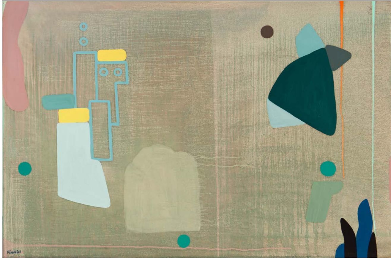
Reaching the Outskirts of Sterile Thought , oil on canvas, 39¼ x 59 inches, 100 x 150 cms