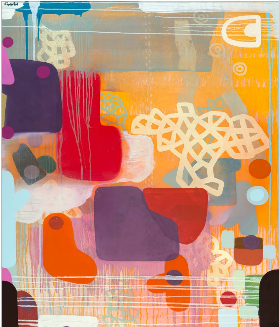
The Longest Lifespan of Blue , oil on canvas, 59 x 47¼ inches, 150 x 120 cms