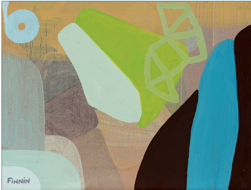
View from Studio (Italy, early morning) , oil on canvas, 12 x 15¼ inches, 30 x 40 cms