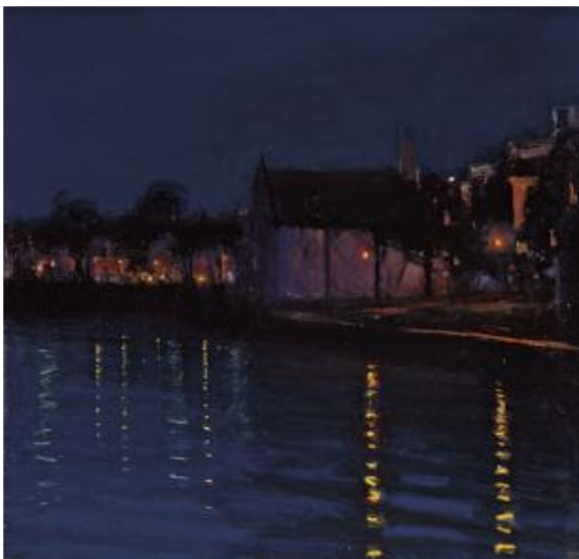
— Gravesend , 2012 oil on panel 52.5 x 54 cm, 20 3 / 4 x 21 1 / 4 ins