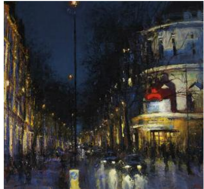
— From Victoria , 2012 oil on panel 29 x 29 cm, 11½ x 11¾ ins