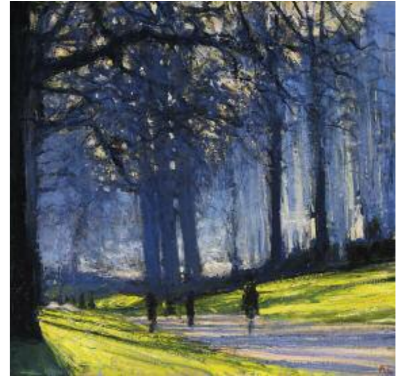
— Green Park, Blue Haze , 2012 oil on panel 38 x 40 cm, 15 x 15 \frac{3}{4} ins