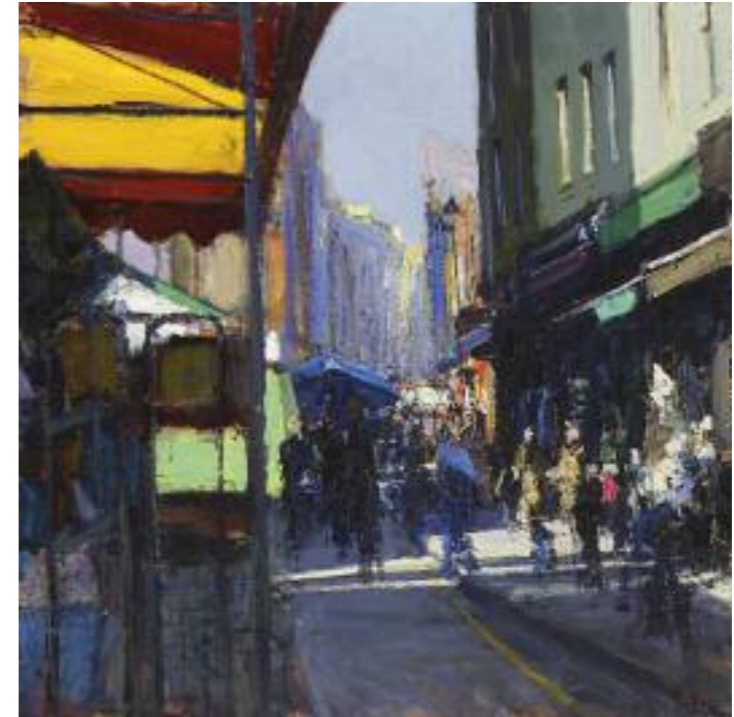
— Berwick Street , 2012 oil on panel 29 x 29 cm, 11 \frac{3}{4} x 11 \frac{1}{2} ins