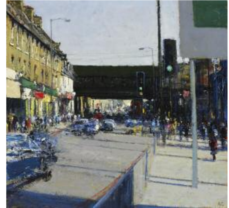
— Stroud Green Road , 2012 oil on panel 33.5 x 33.5 cm, 14 x 13¼ ins