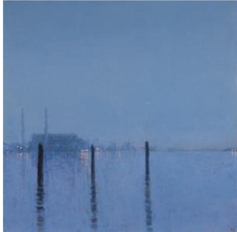
— The Power Station from Gravesend , 2012 oil on panel 45.5 x 47.5 cm, 18 x 18 3 / 4 ins