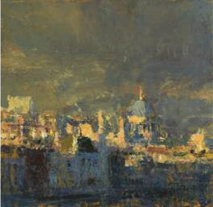
— From Southbank Towards the City, Study 1, 2012 oil on panel 21 x 22 cm, 8¼ x 8¾ ins