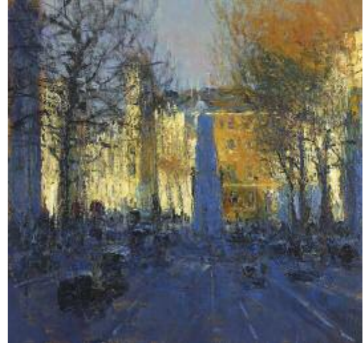
— Cenotaph , 2012 oil on panel 23 x 24 cm, 9 x 9½ ins