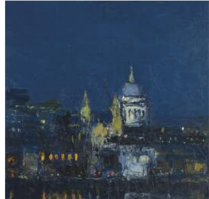
—From Southbank Towards the City, Study 4 , 2012 oil on panel 21 x 22 cm, 8¼ x 8¾ ins