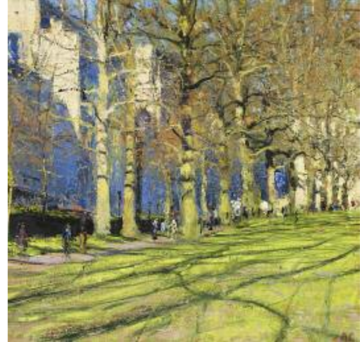
— Green Park Trees & Shadows , 2012 oil on panel 29 x 30 cm, 11½ x 11¾ ins