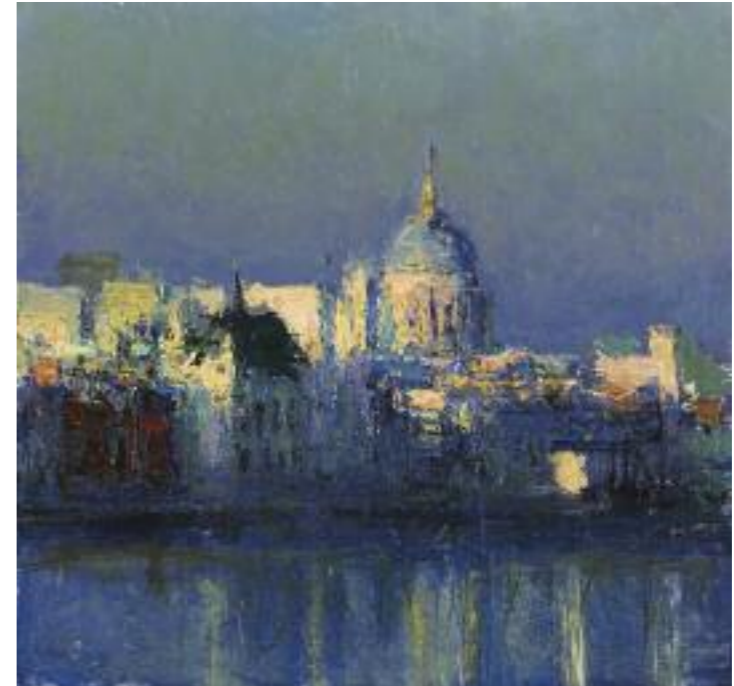
—From Southbank Towards the City, Study 2 , 2012 oil on panel 21 x 22 cm, 8¼ x 8¾ ins