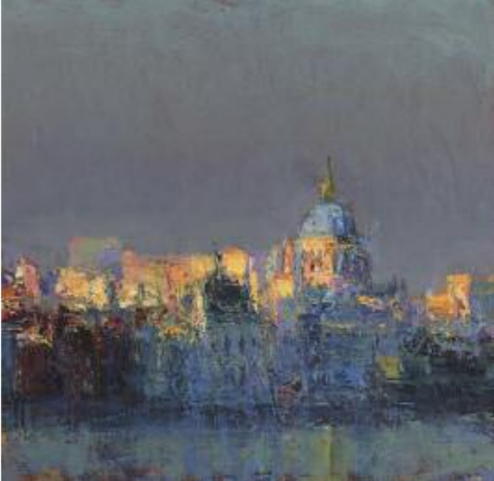
—From Southbank Towards the City, Study 3 , 2012 oil on panel 21 x 22 cm, 8¼ x 8¾ ins