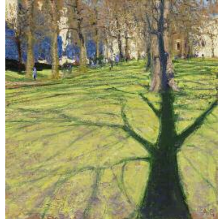
— Green Park with Shadow of Tree , 2012 oil on panel 25.5 x 25 cm, 10 x 9¾ ins