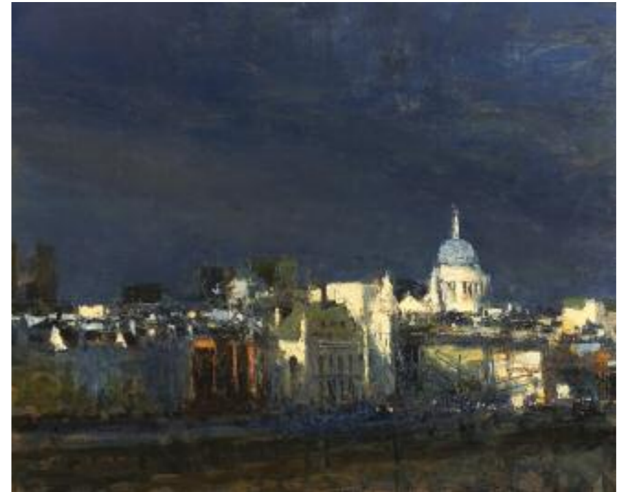
—From Southbank Towards the City study 5 , 2012 oil on panel 40 x 50 cm, 15 3 / 4 x 19 3 / 4 ins