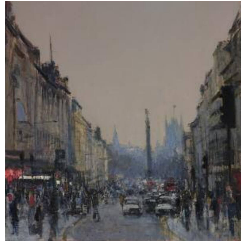
— Towards Trafalgar Square , 2012 oil on panel 54 x 55.5 cm, 21¼ x 21¾ ins