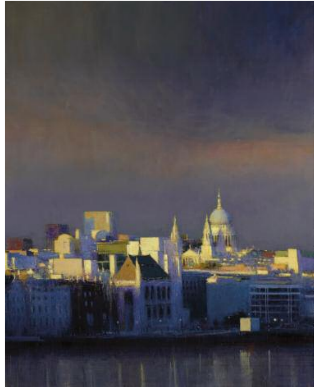
—From Southbank Towards the City 1 , 2012 oil on canvas 180 x 145 cm, 70¾ x 57 ins